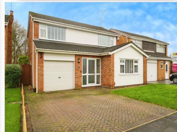
Arderne Close, Wirral CH63 9AB