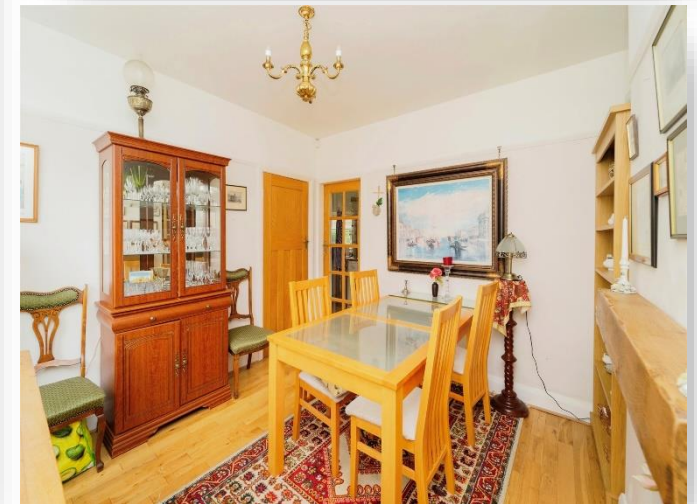
Bromborough Road, Wirral CH63 7RH