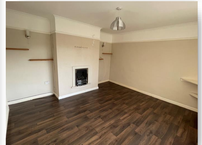
Thornleigh Avenue, Wirral, CH62 9BB