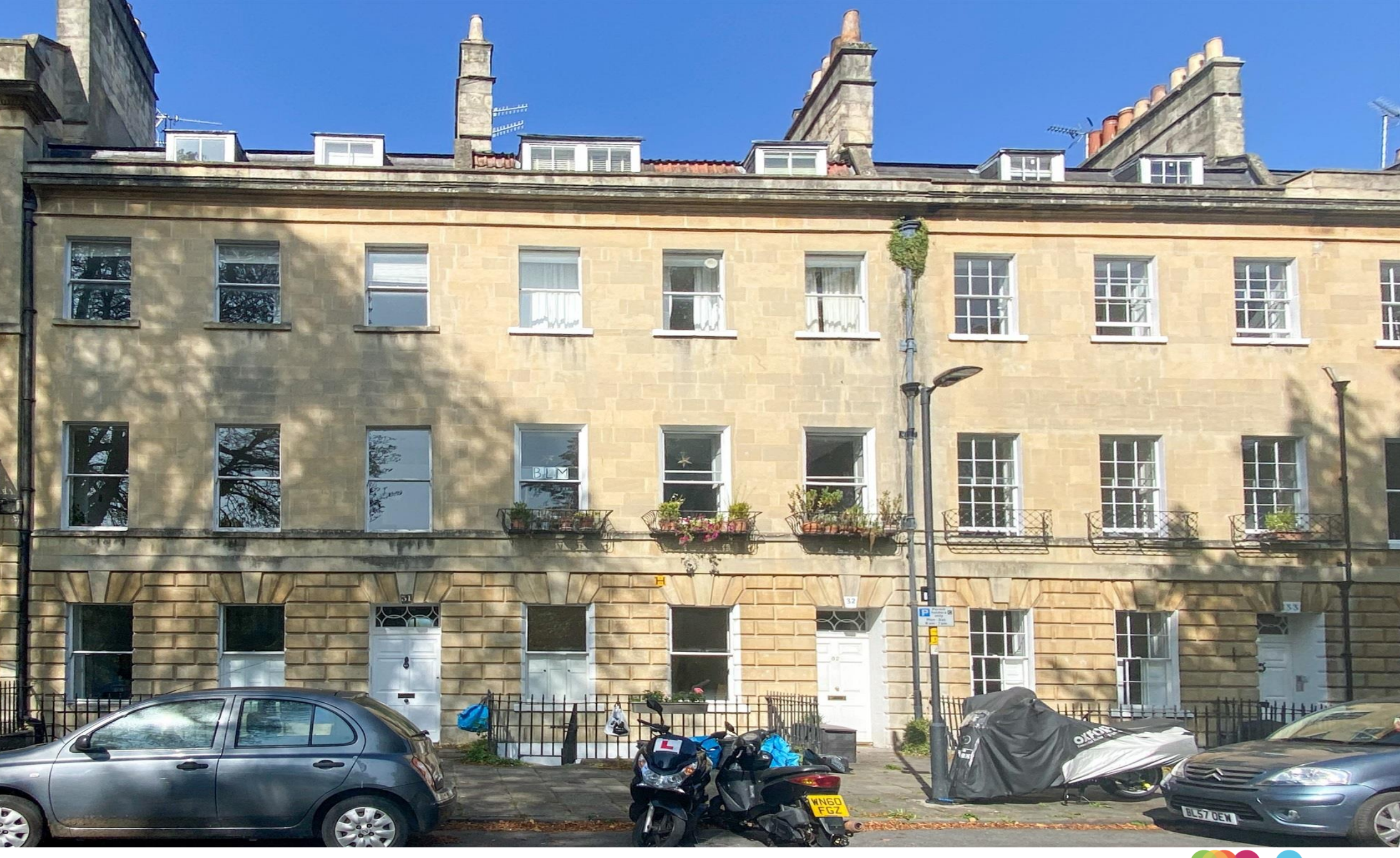
Green Park, Bath, BA1 1HZ