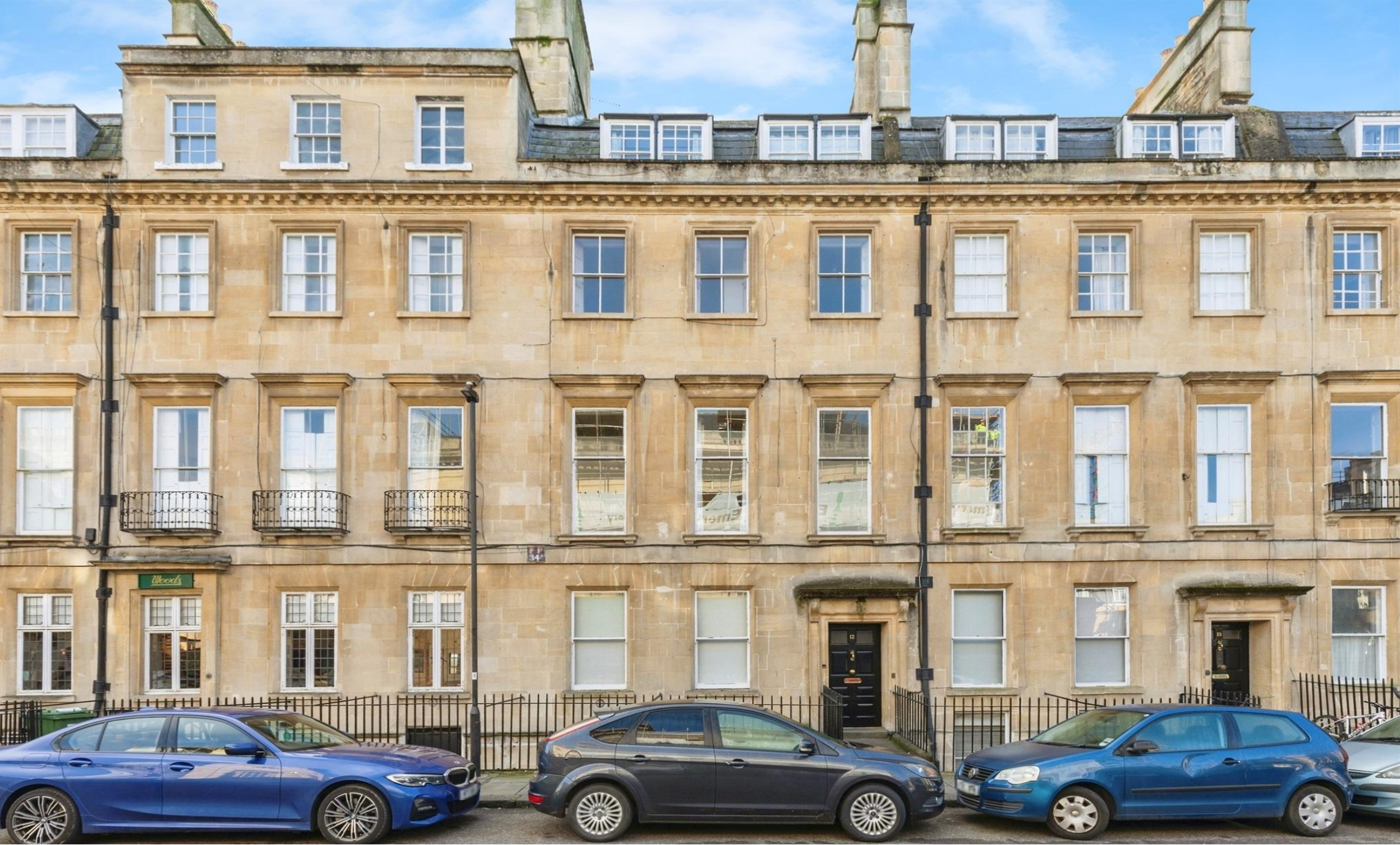
Lower Ground Floor Flat Alfred Street, Bath BA1 2QX