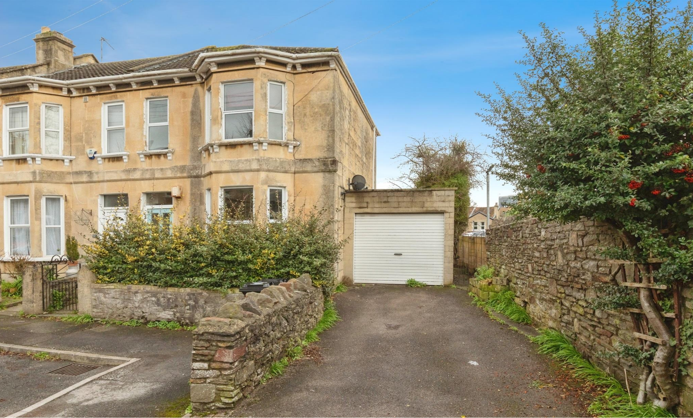
Shaftesbury Avenue, Bath BA1 3DT