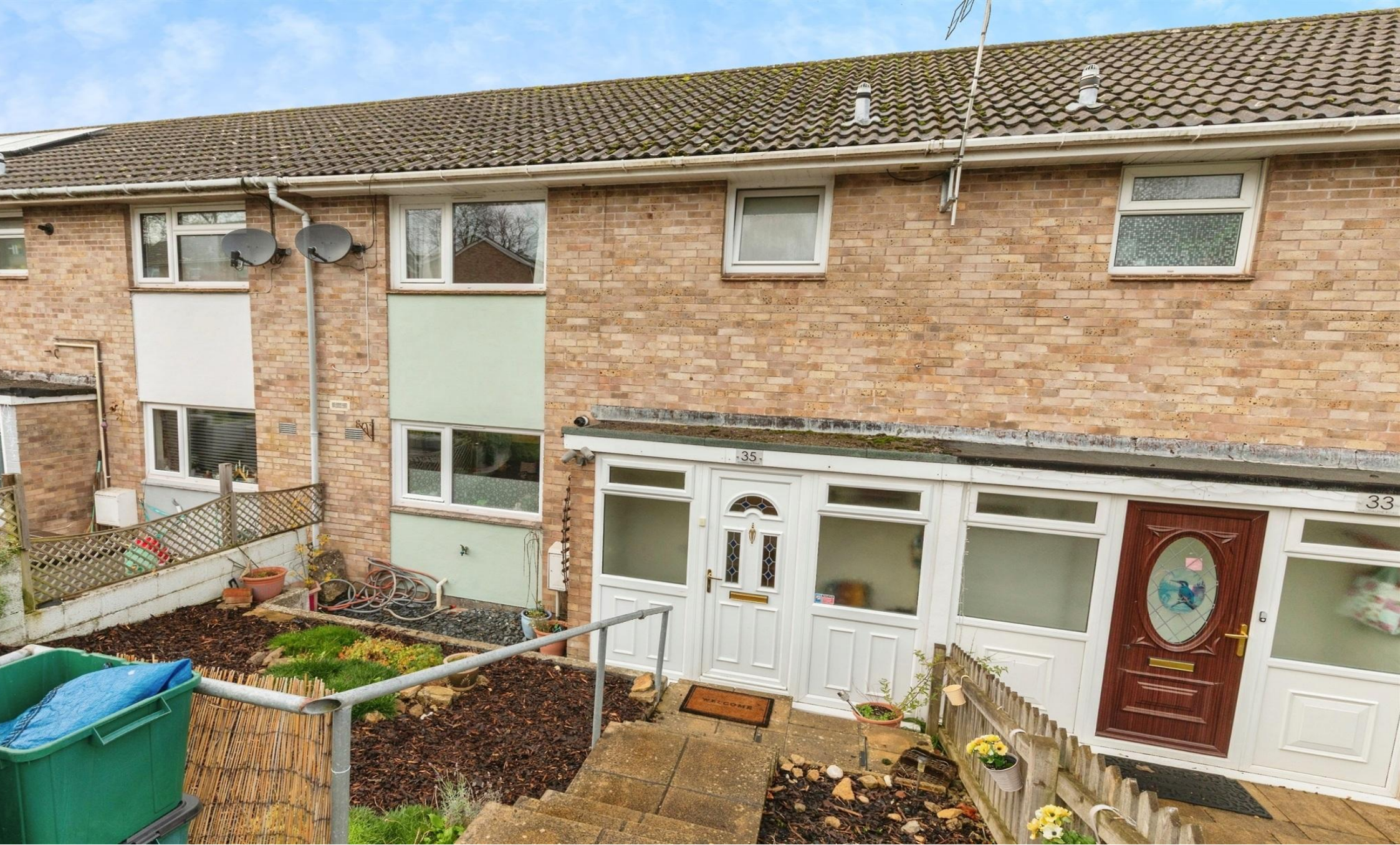
Magdalene Road, Radstock BA3 3LB