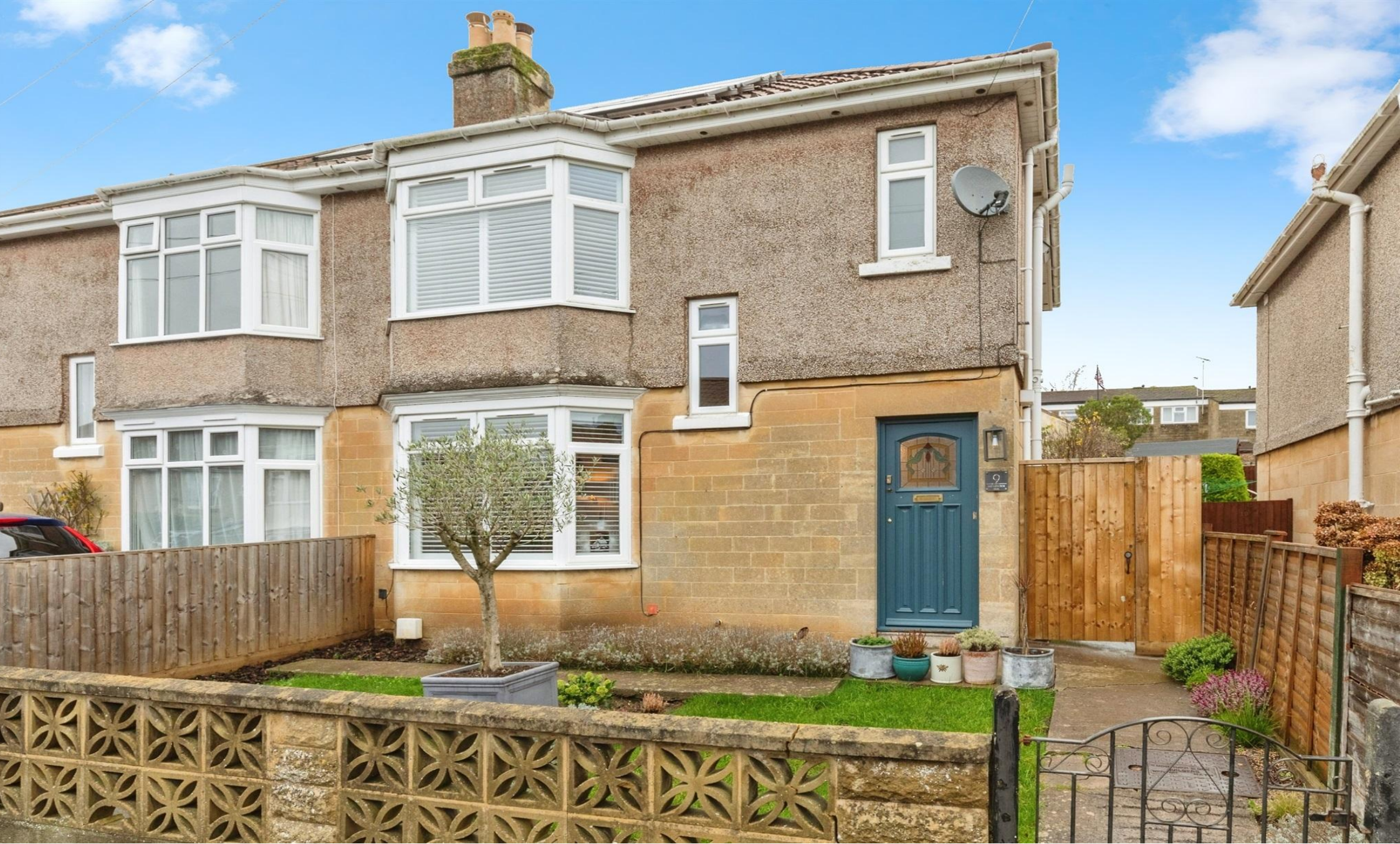
Broadmoor Park, Bath BA1 4JW

Not for marketing purposes INTERNAL USE ONLY