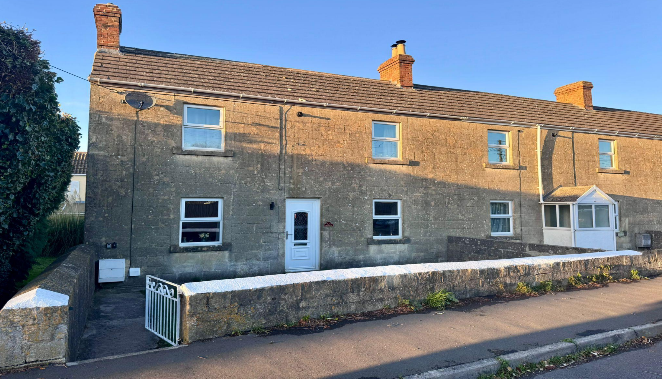
Church Road, Peasedown St. John Bath BA2 8AD