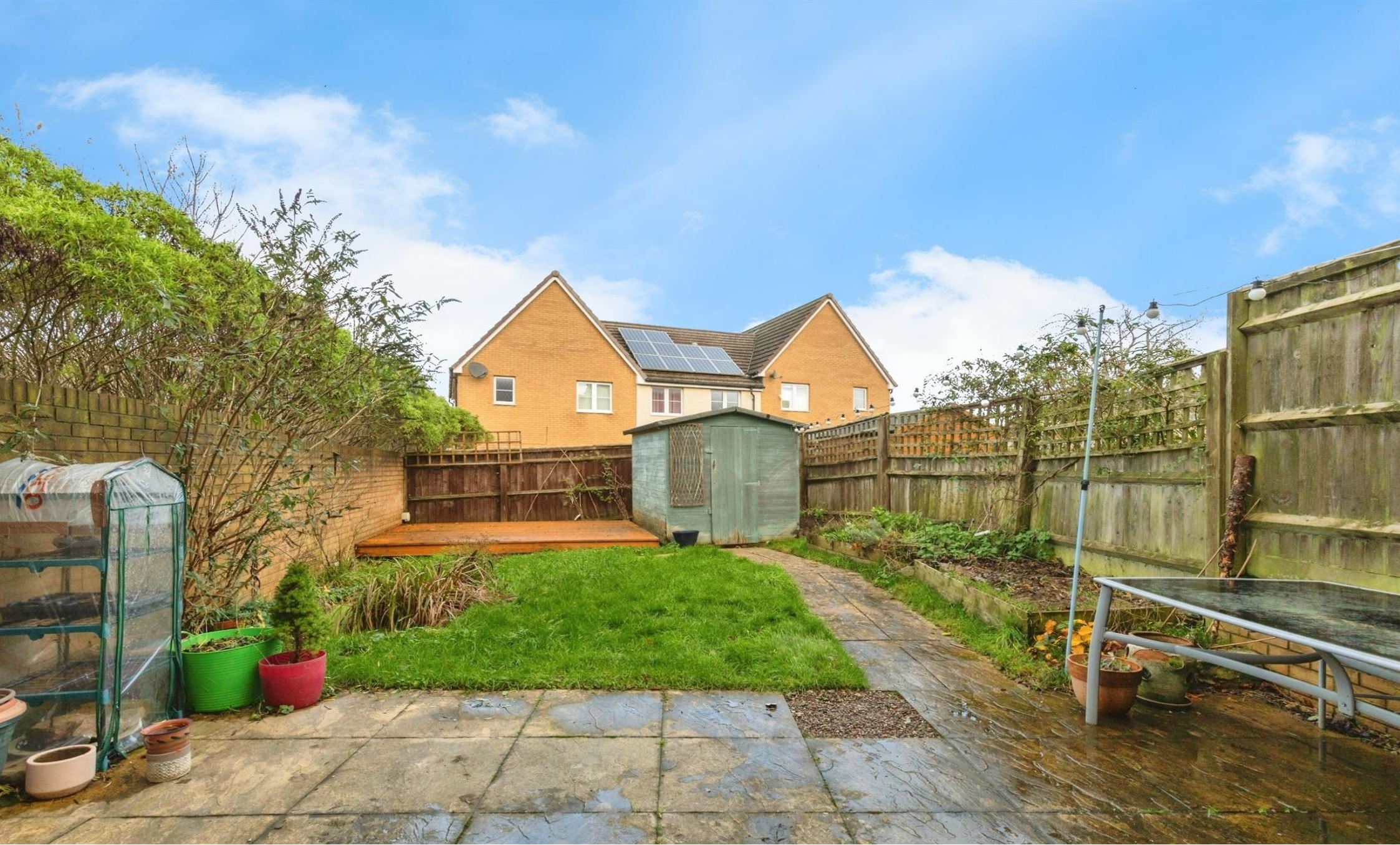
Pennyquick View, Bath BA2 1RZ