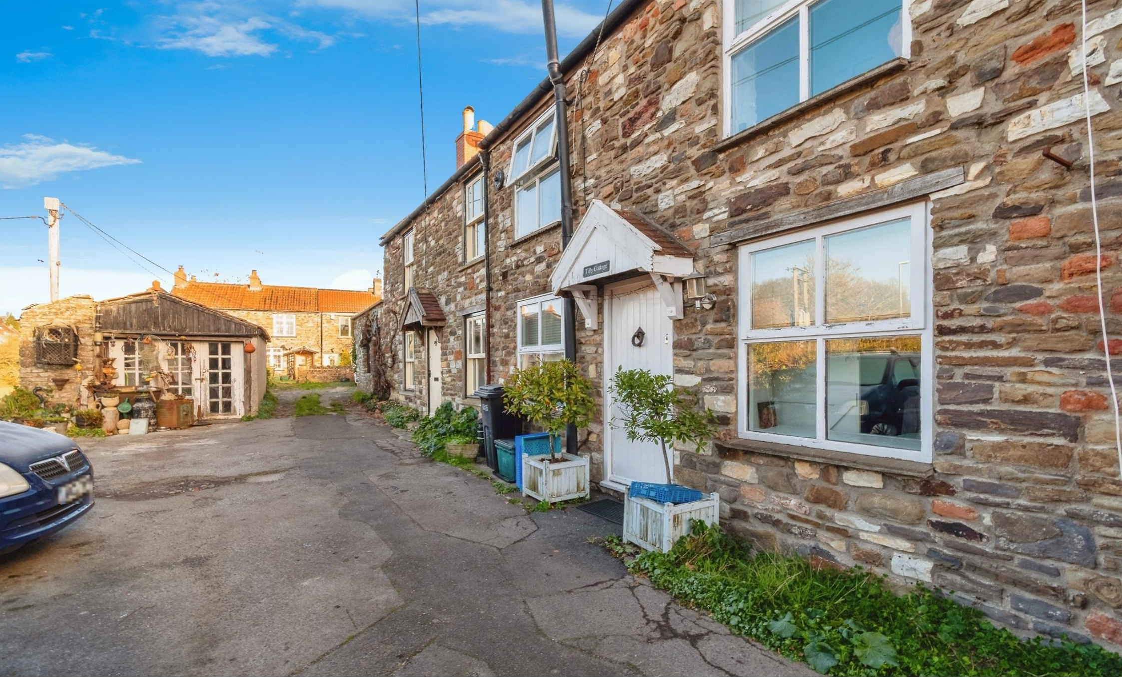
Tilley Cottage High Street, Pensford Bristol BS39 4HN