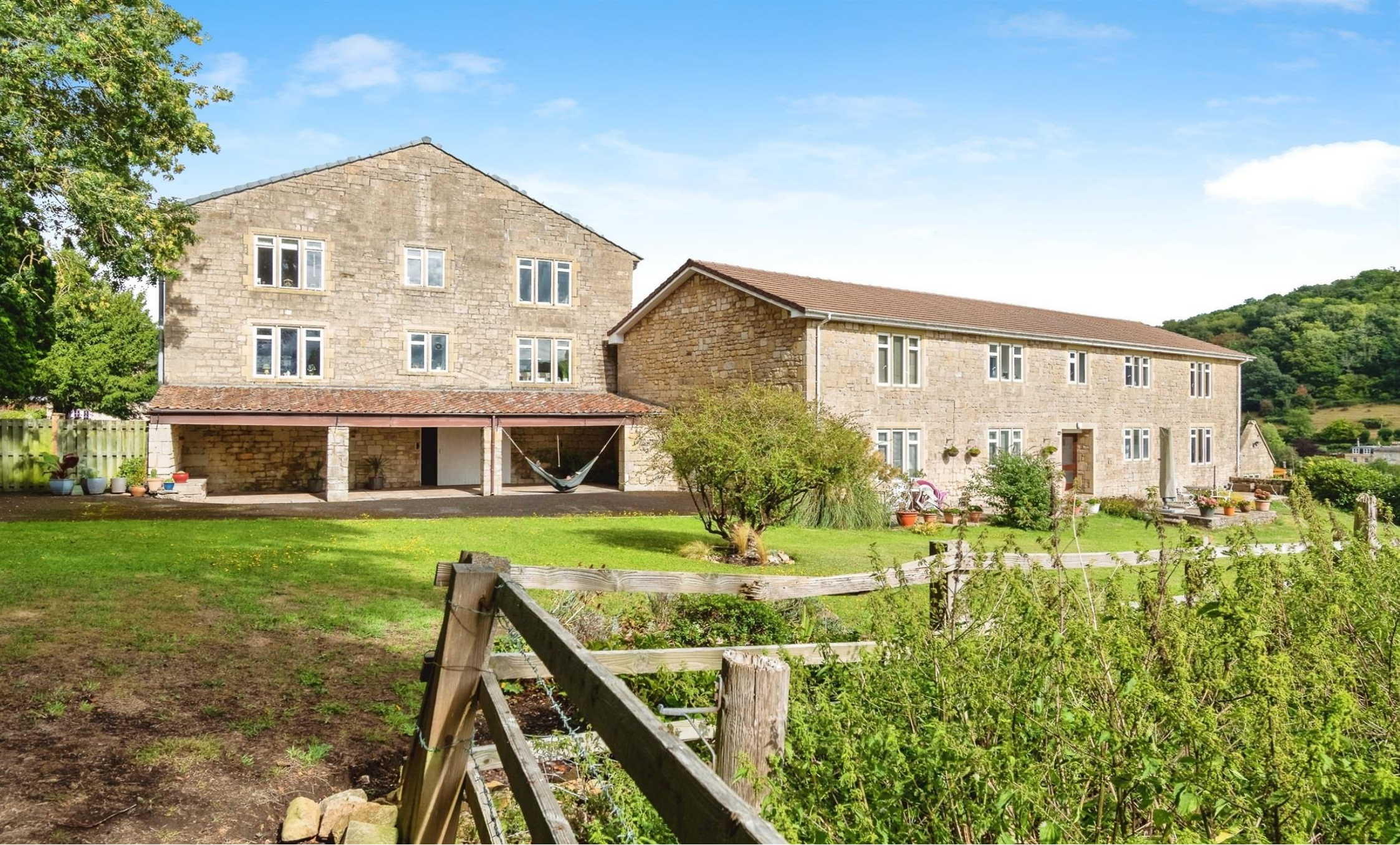
St. Michaels Court, Monkton Combe Bath BA2 7ES