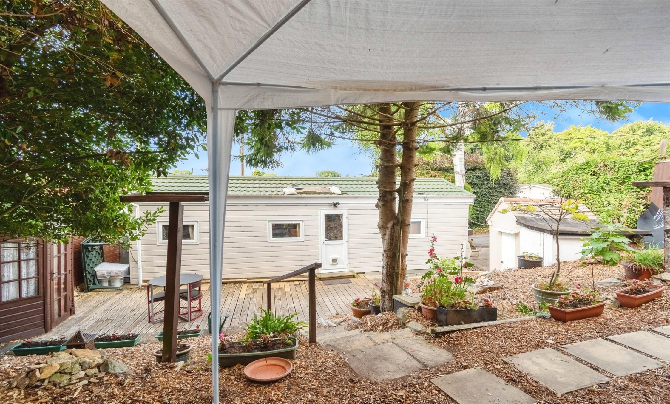
Quarry Rock Gardens,Bath BA2 6EF