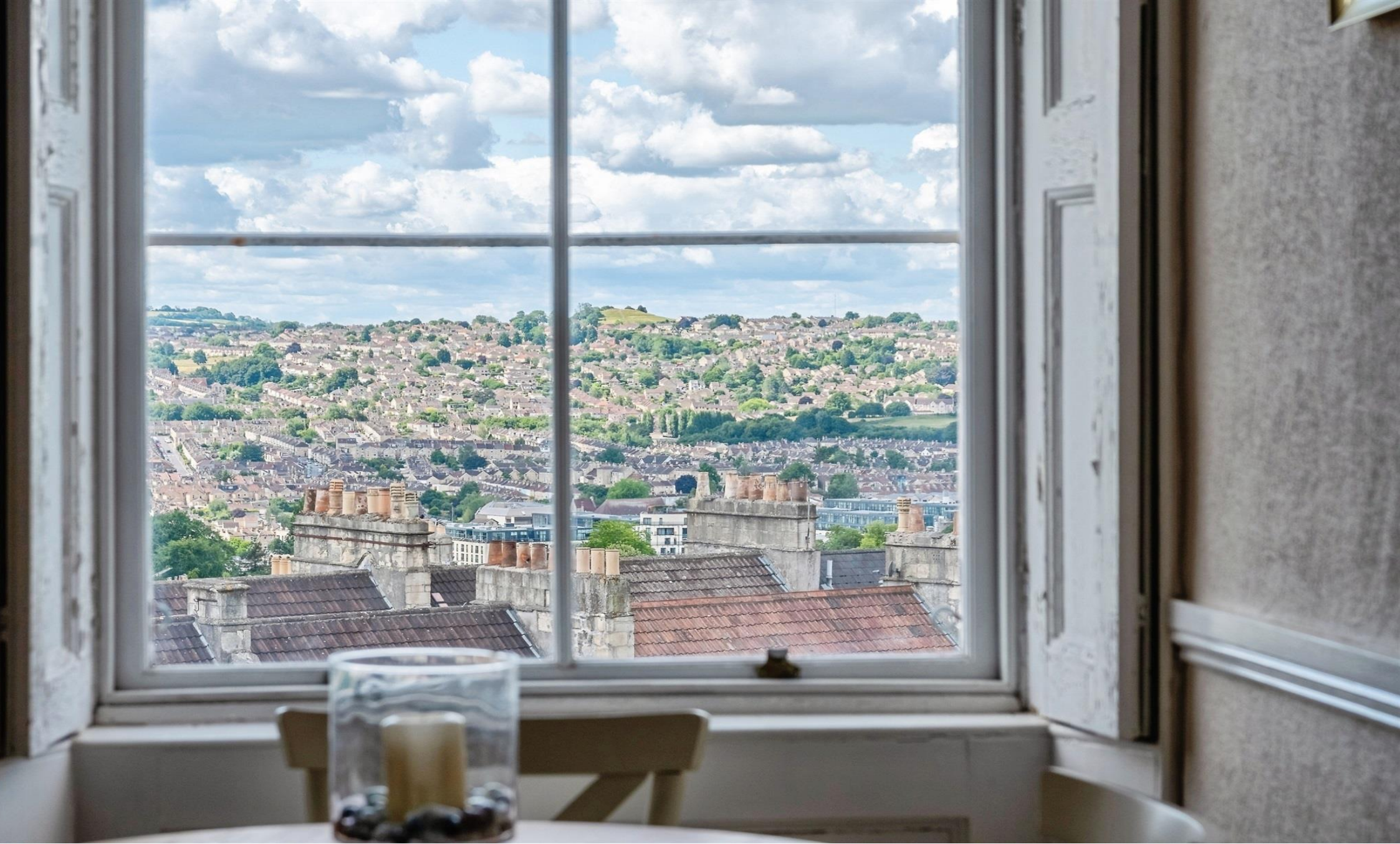
First Floor Flat Spencers Belle Vue, Bath BA1 5ER