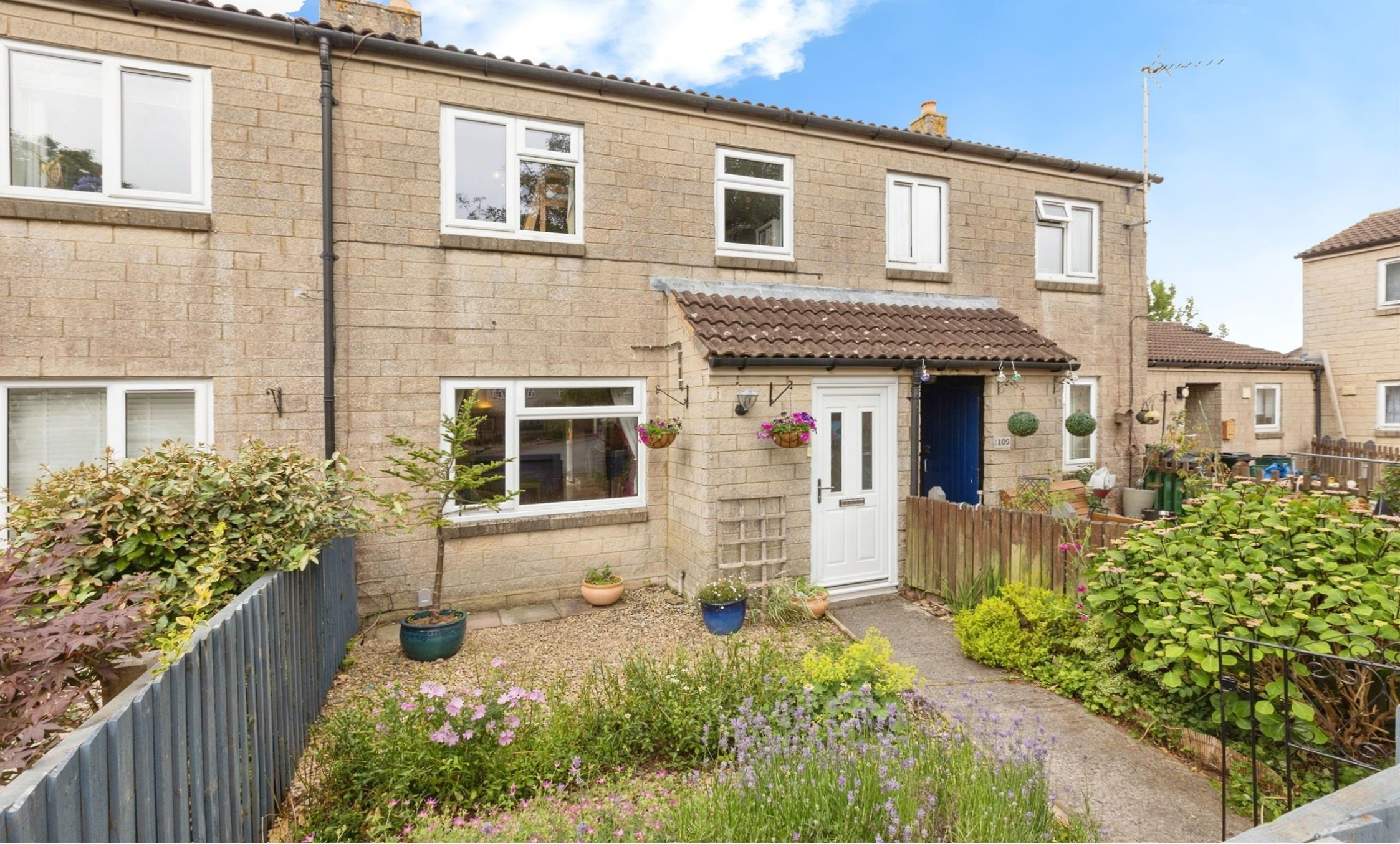
Rosewarn Close, Bath BA2 1PJ