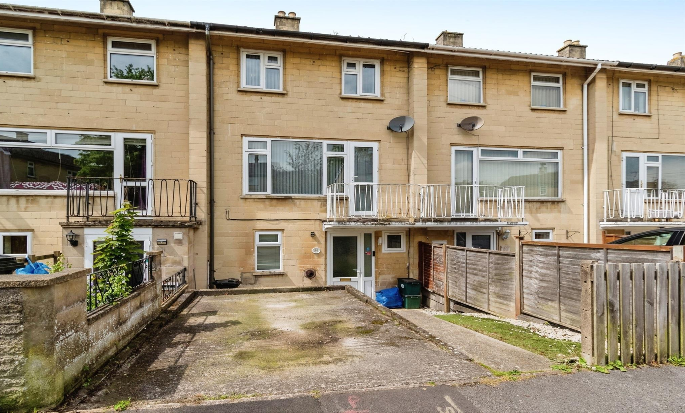
Sheridan Road, Bath BA2 1RA