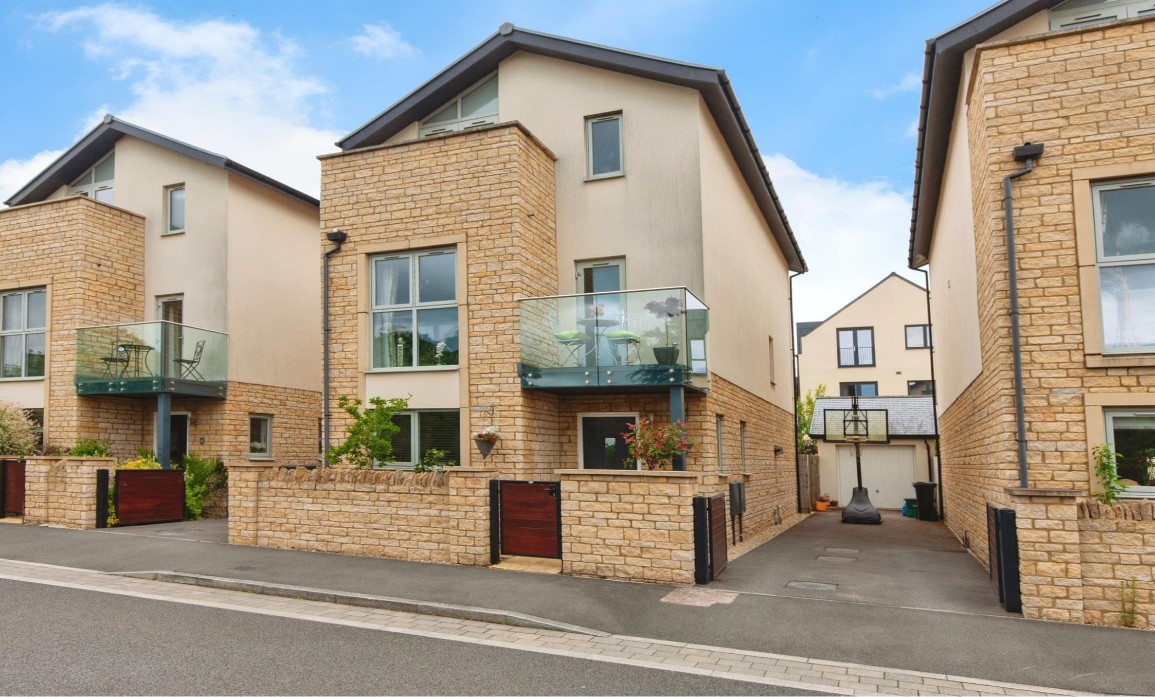
Beckford Drive, Lansdown Bath BA1 9AU