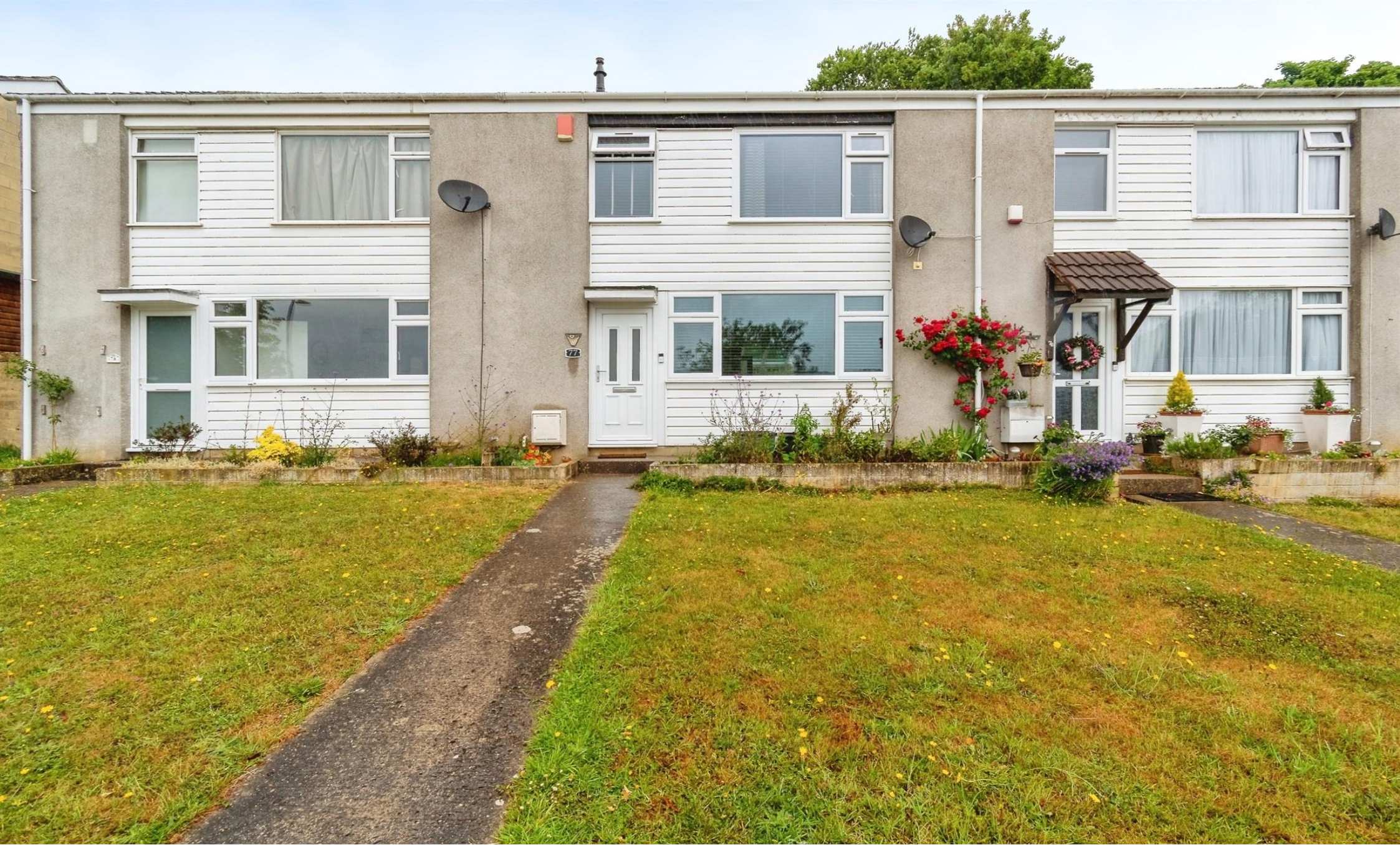
Redland Park ,BATH BA2 1SH