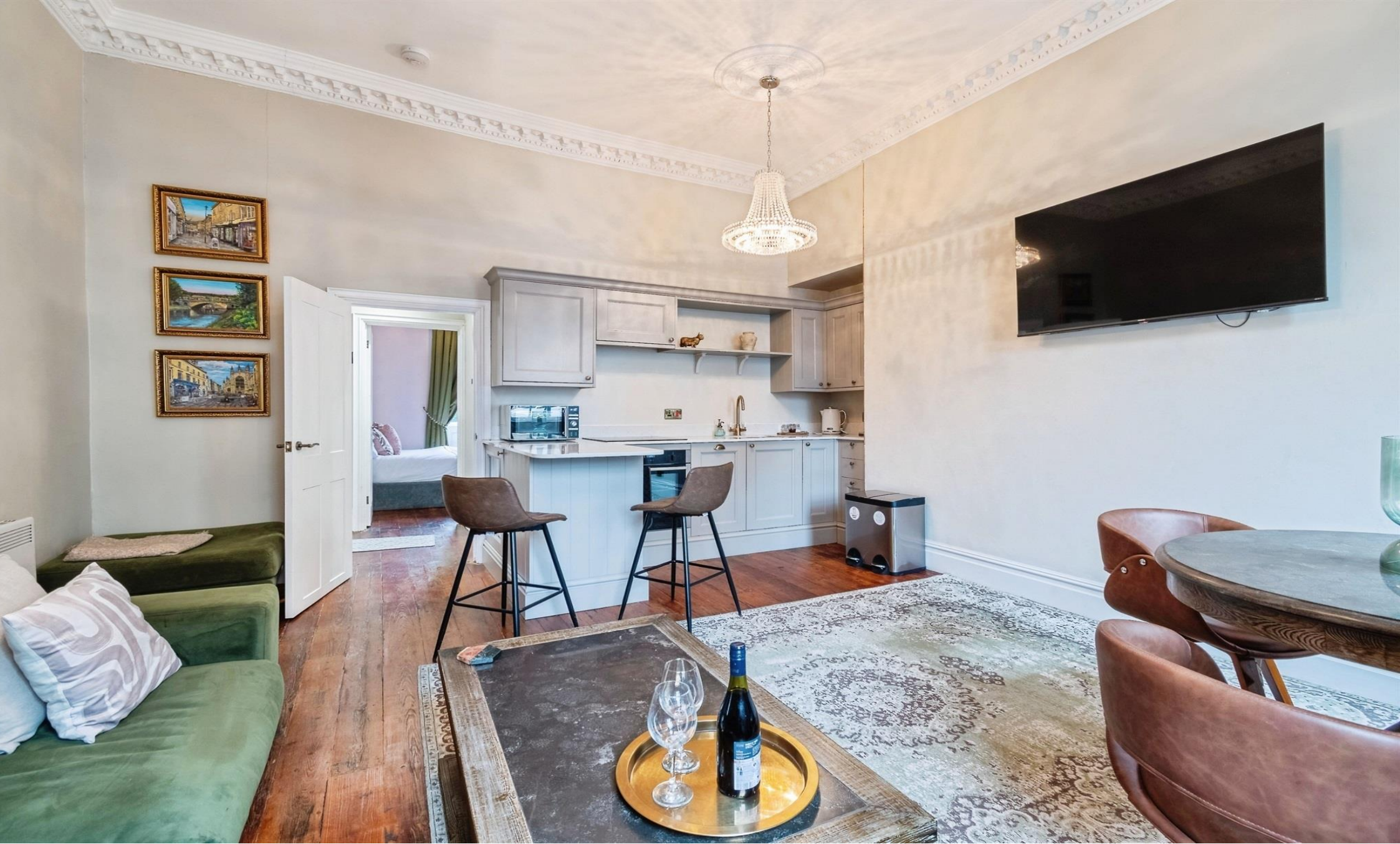
Flat 1 Alfred Street, Bath BA1 2QU