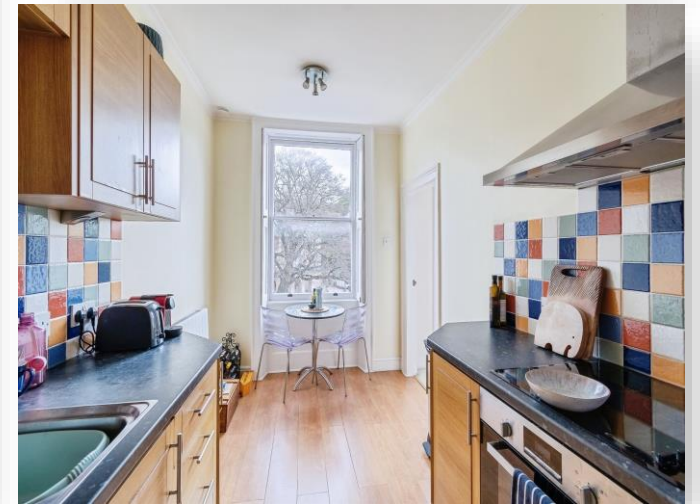
Flat 4 Sydney Place, Bath BA2 6NF