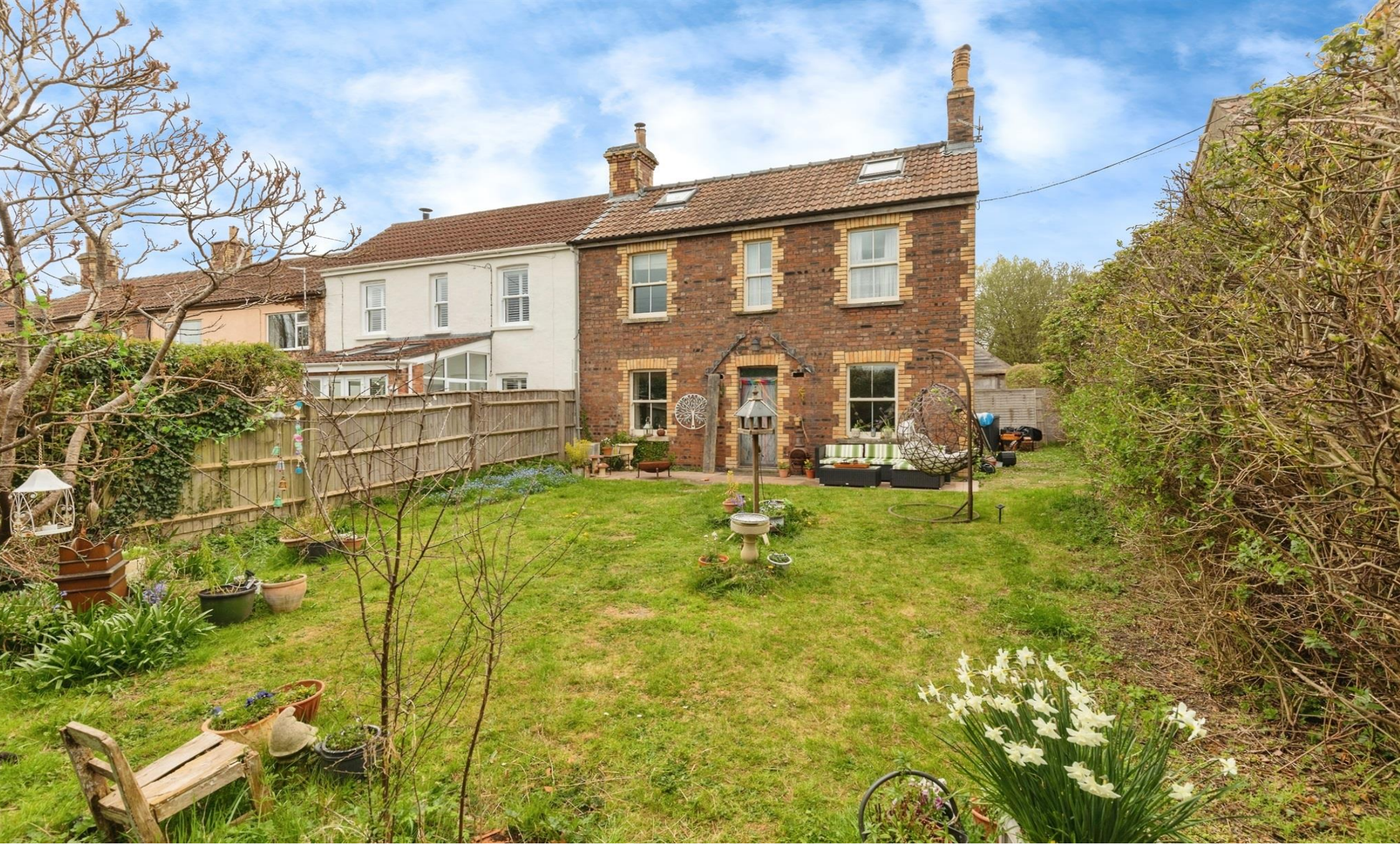
Maynard Terrace, Clutton Bristol BS39 5PW