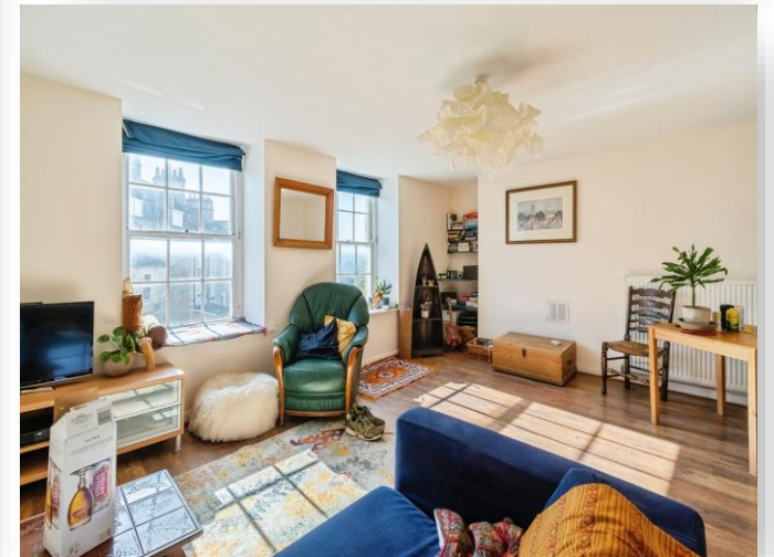
Morford Street, Bath BA1 2RJ