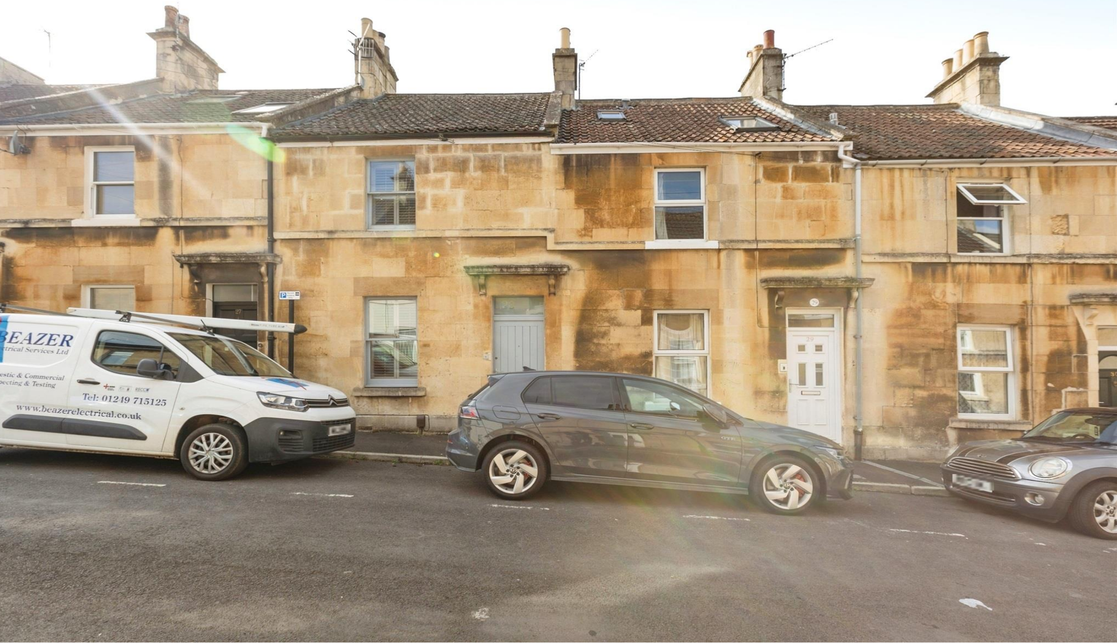
Sydenham Buildings, Bath BA2 3BS