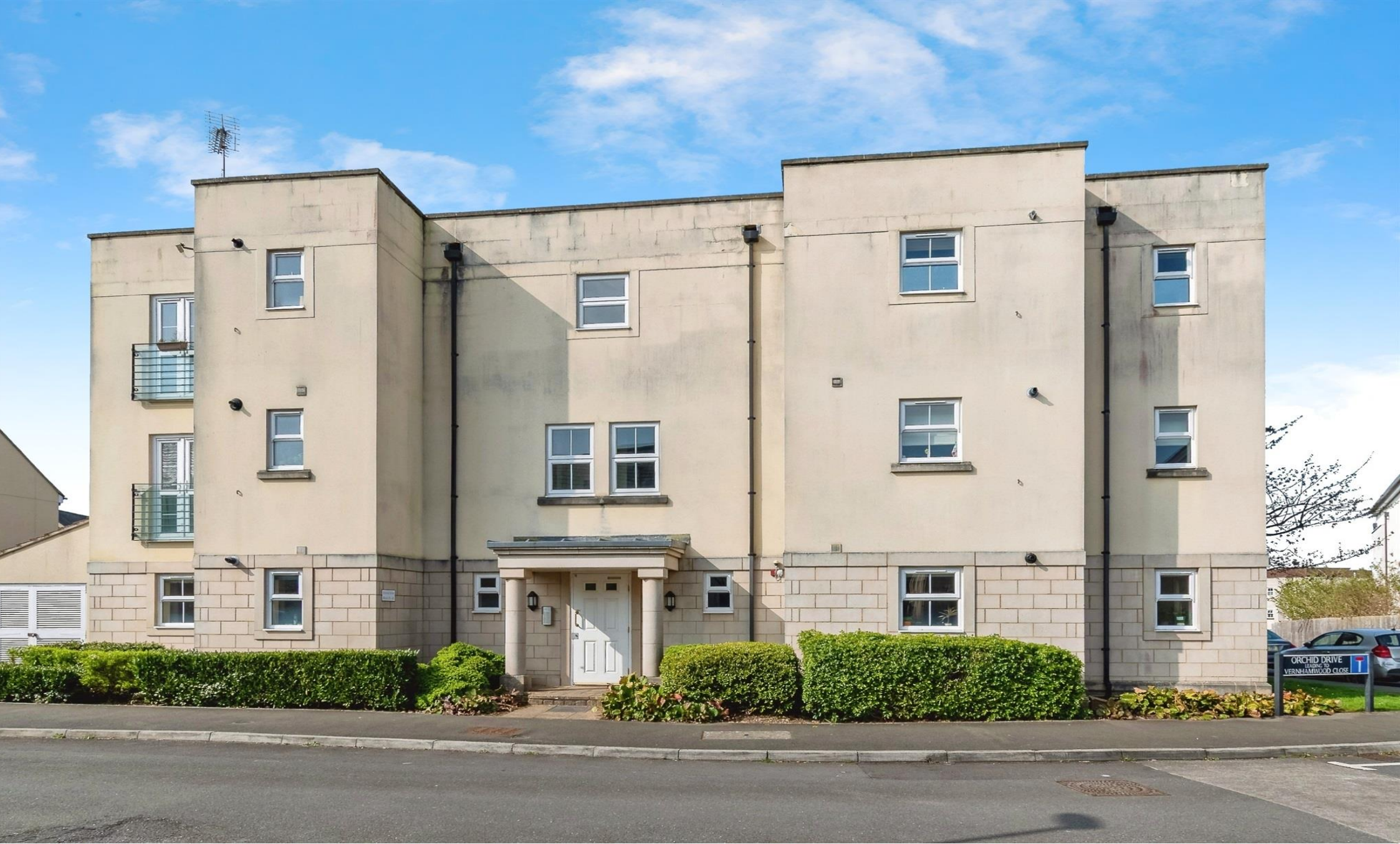
Orchid Drive, Bath BA2 2TS