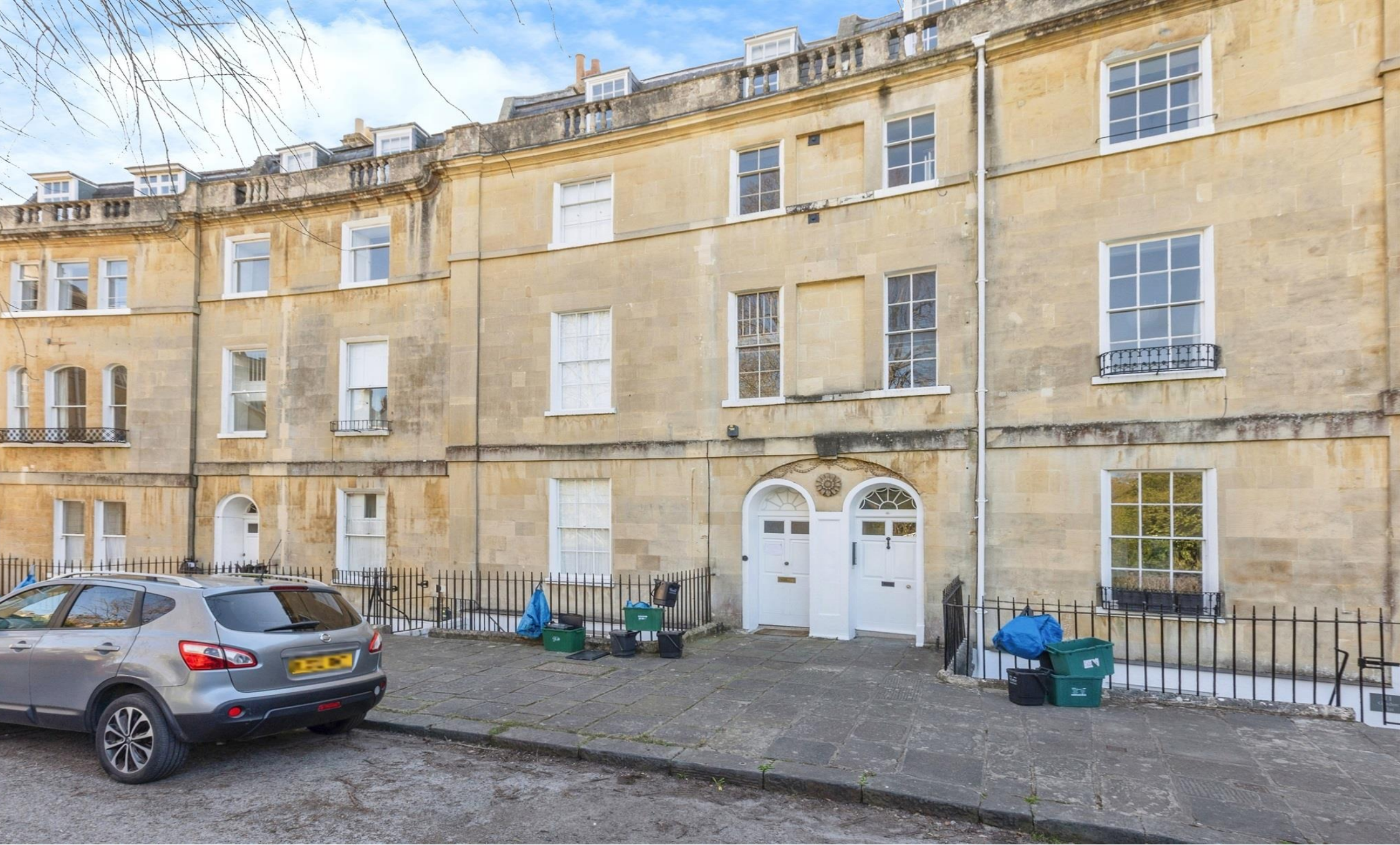
Second And Third Floor Flat Widcombe Crescent, Bath BA2 6AH