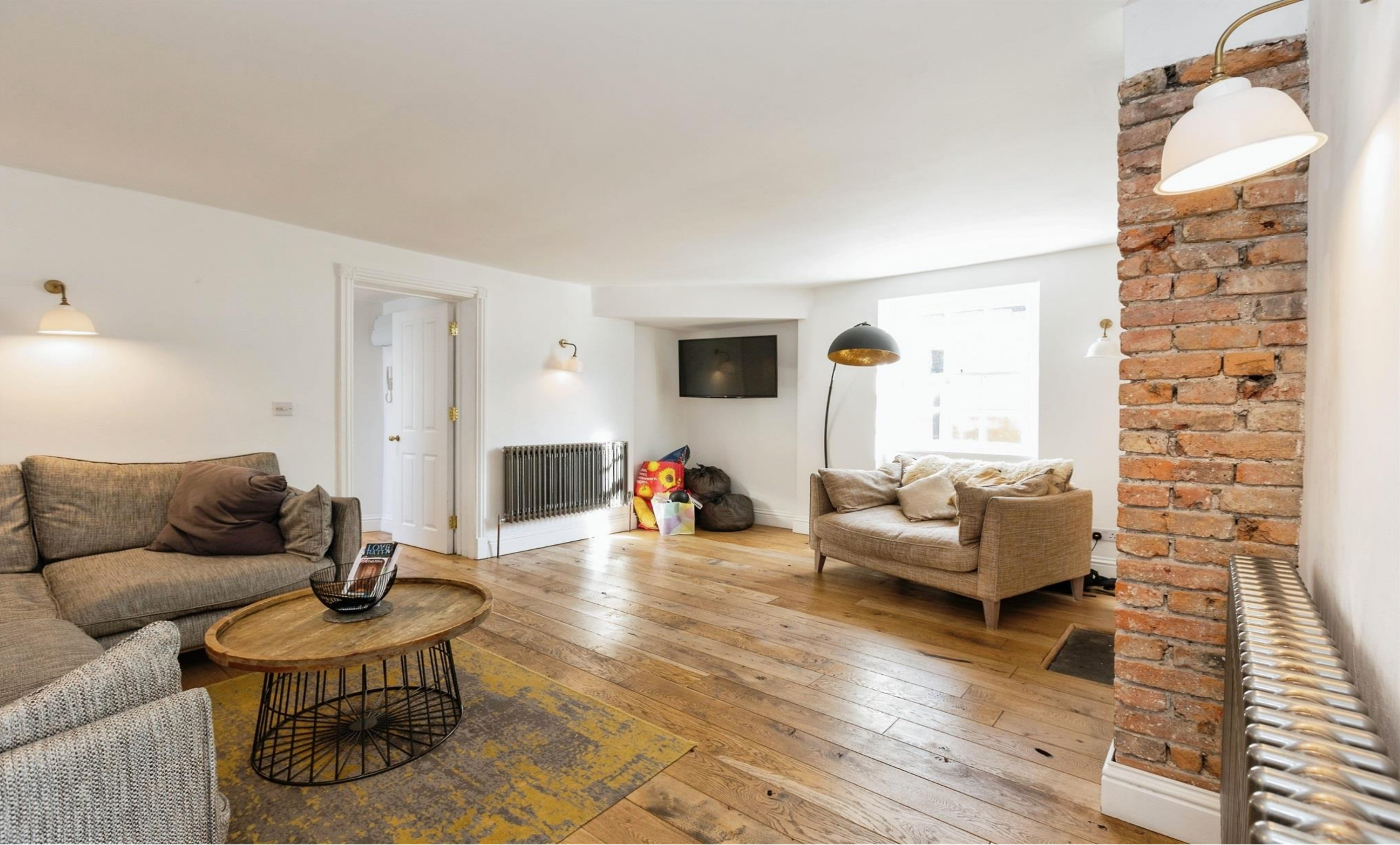
Third Floor Flat Northgate Street, Bath BA1 5AS