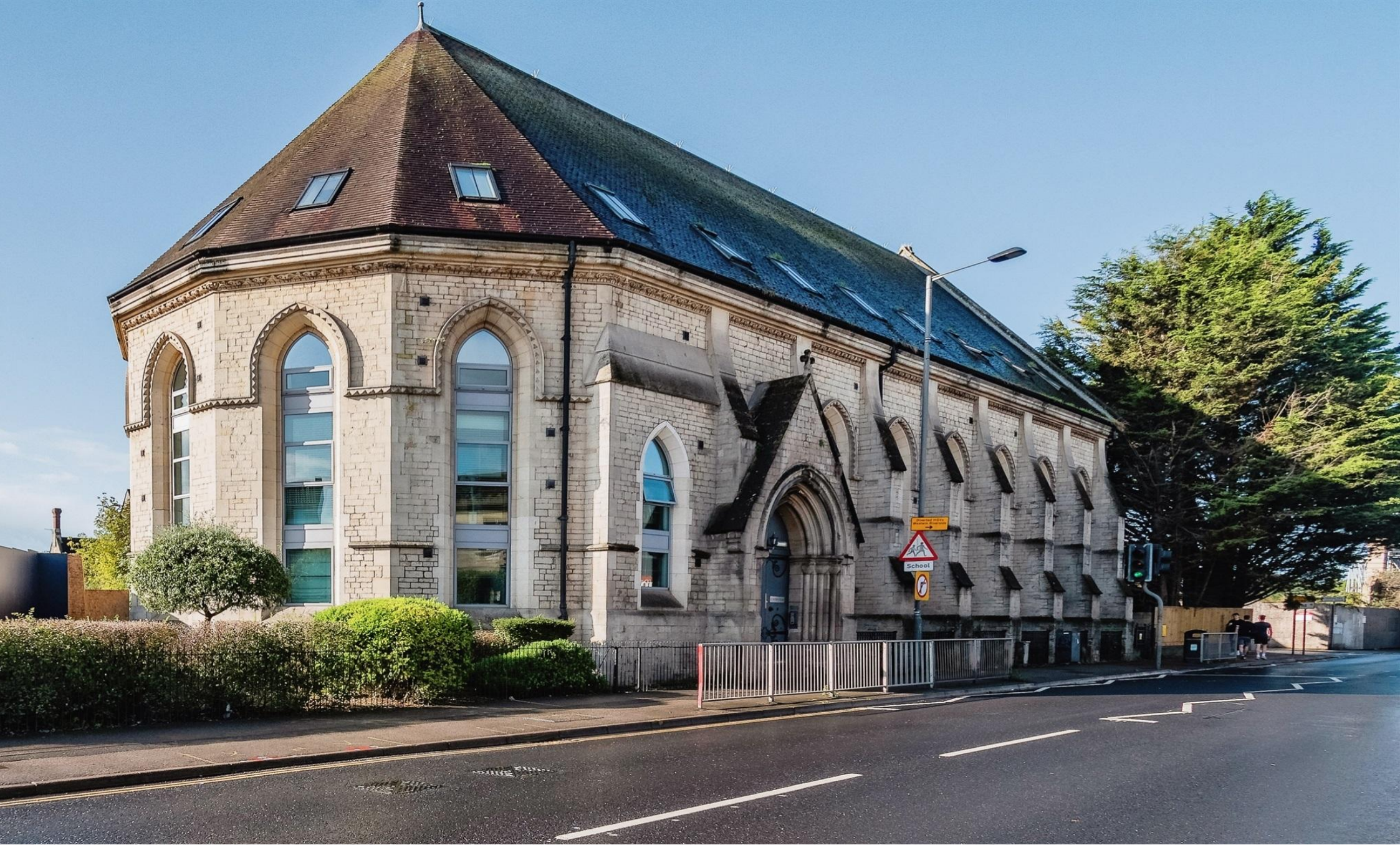
St. Peters Place Lower Bristol Road, Bath BA2 3EP