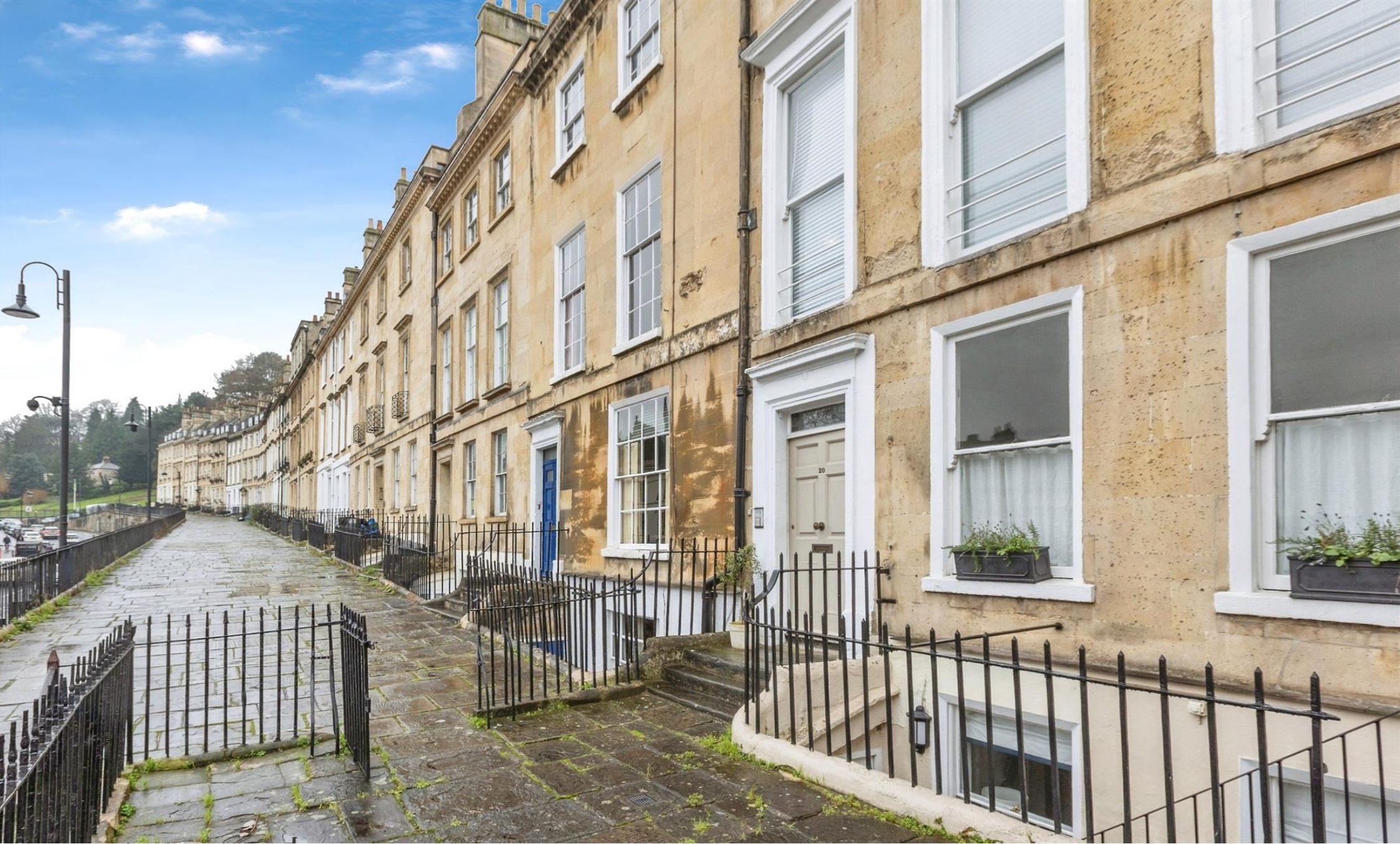
Flat 3 Walcot Parade, Bath BA1 5NF