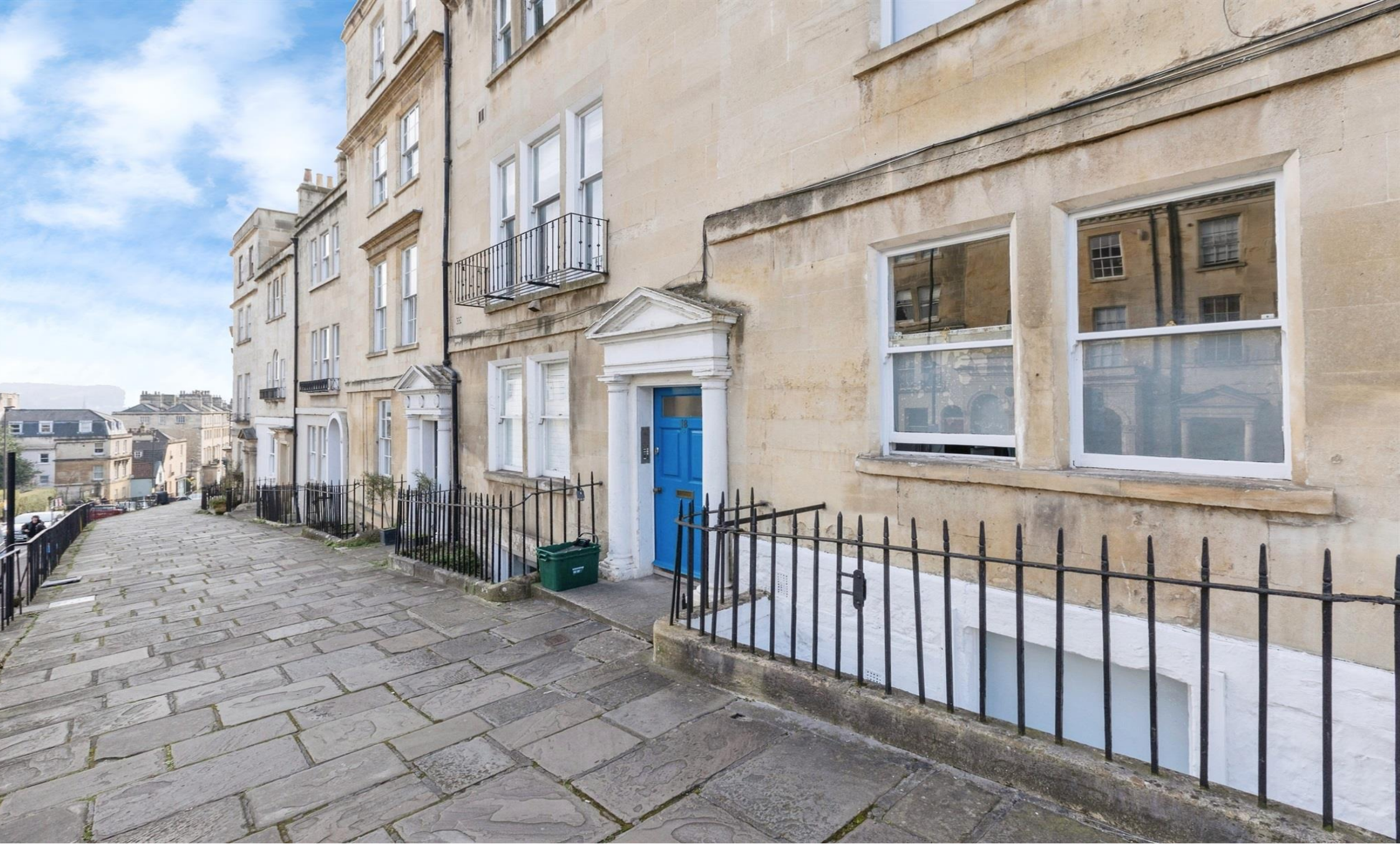
Belvedere, Bath BA1 5ED