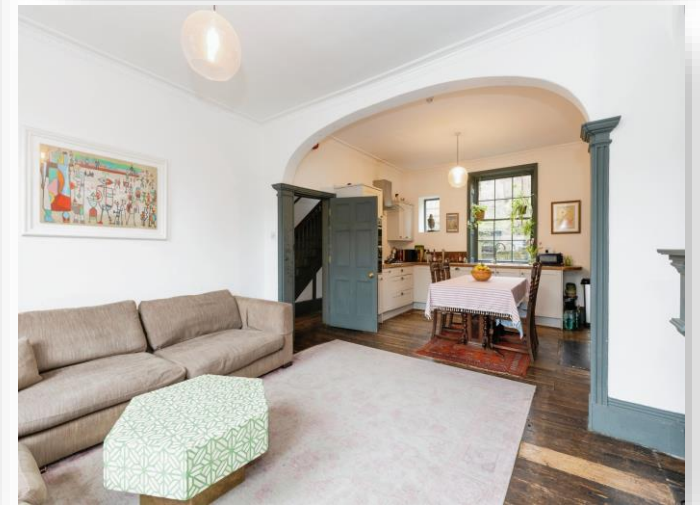
Walcot Parade, Bath BA1 5NF