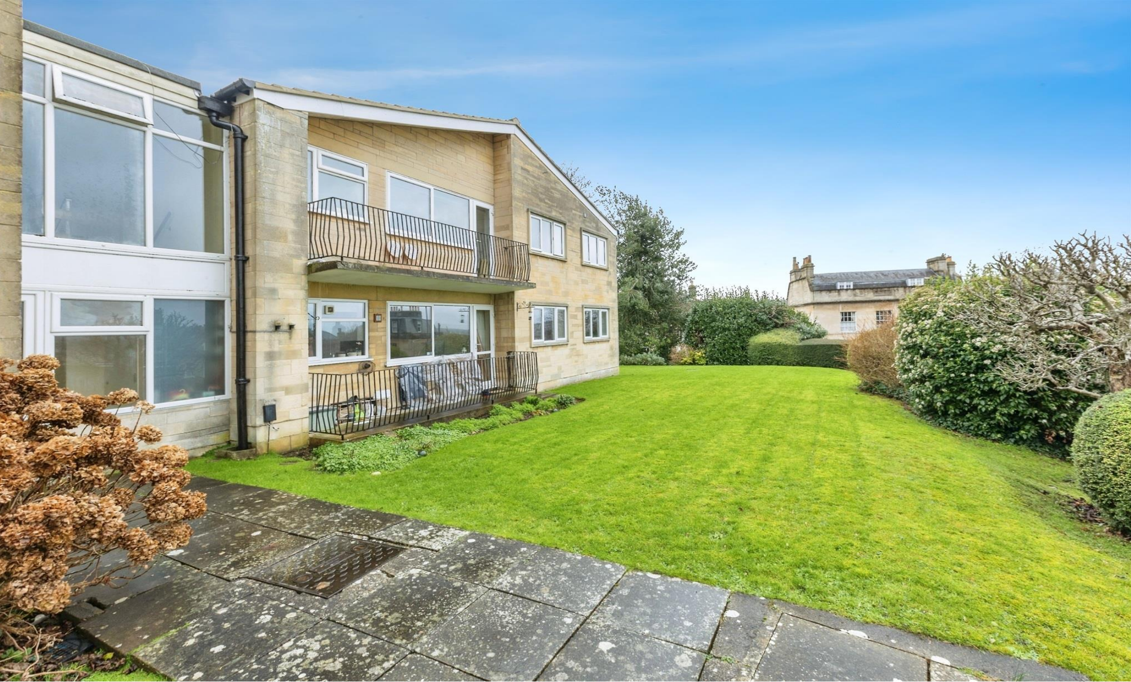
Cleveland Court, Bath BA2 6JY