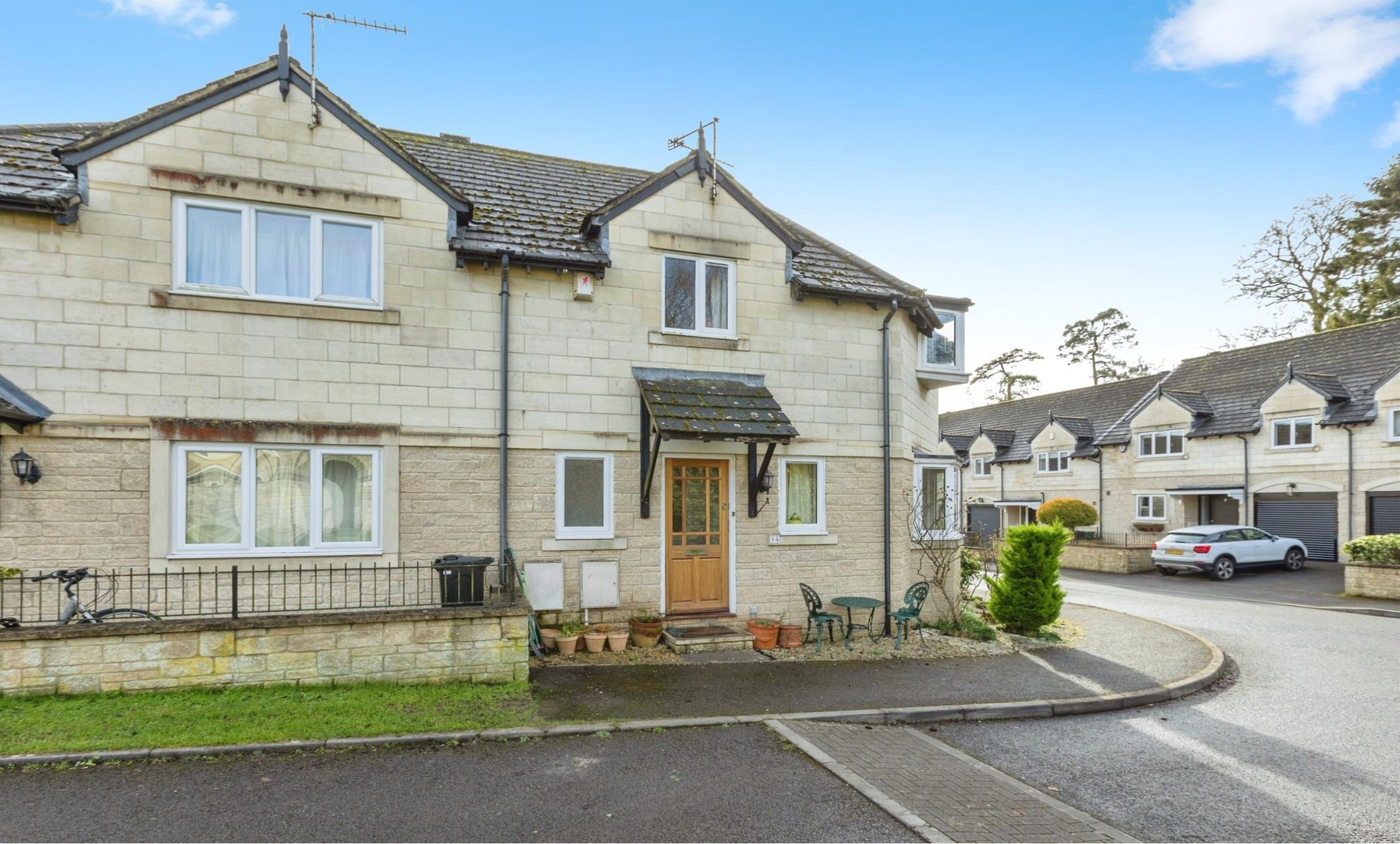
Symes Park, Weston Bath BA1 4PA