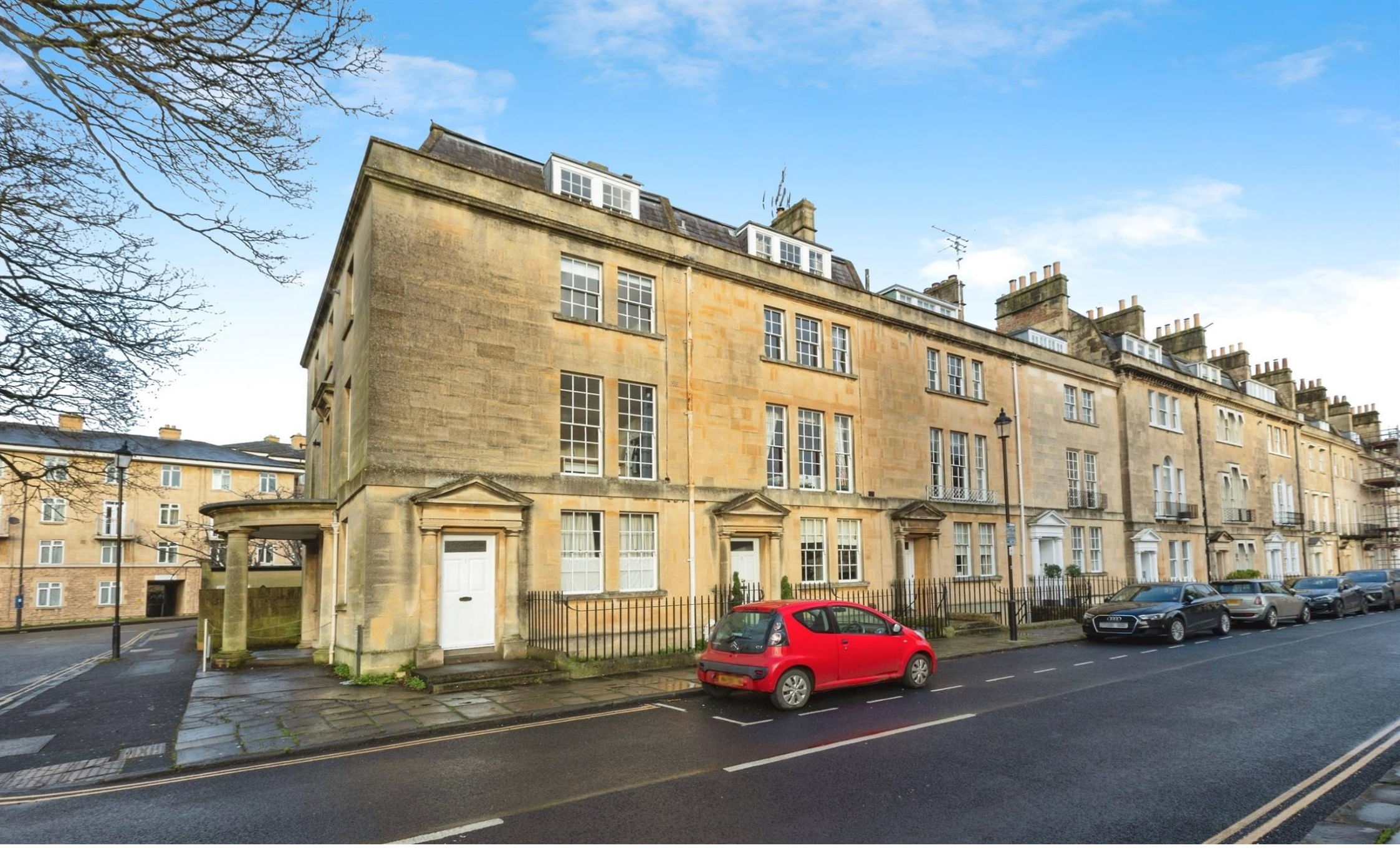
Flat 3 Rivers Street, Bath BA1 2PZ