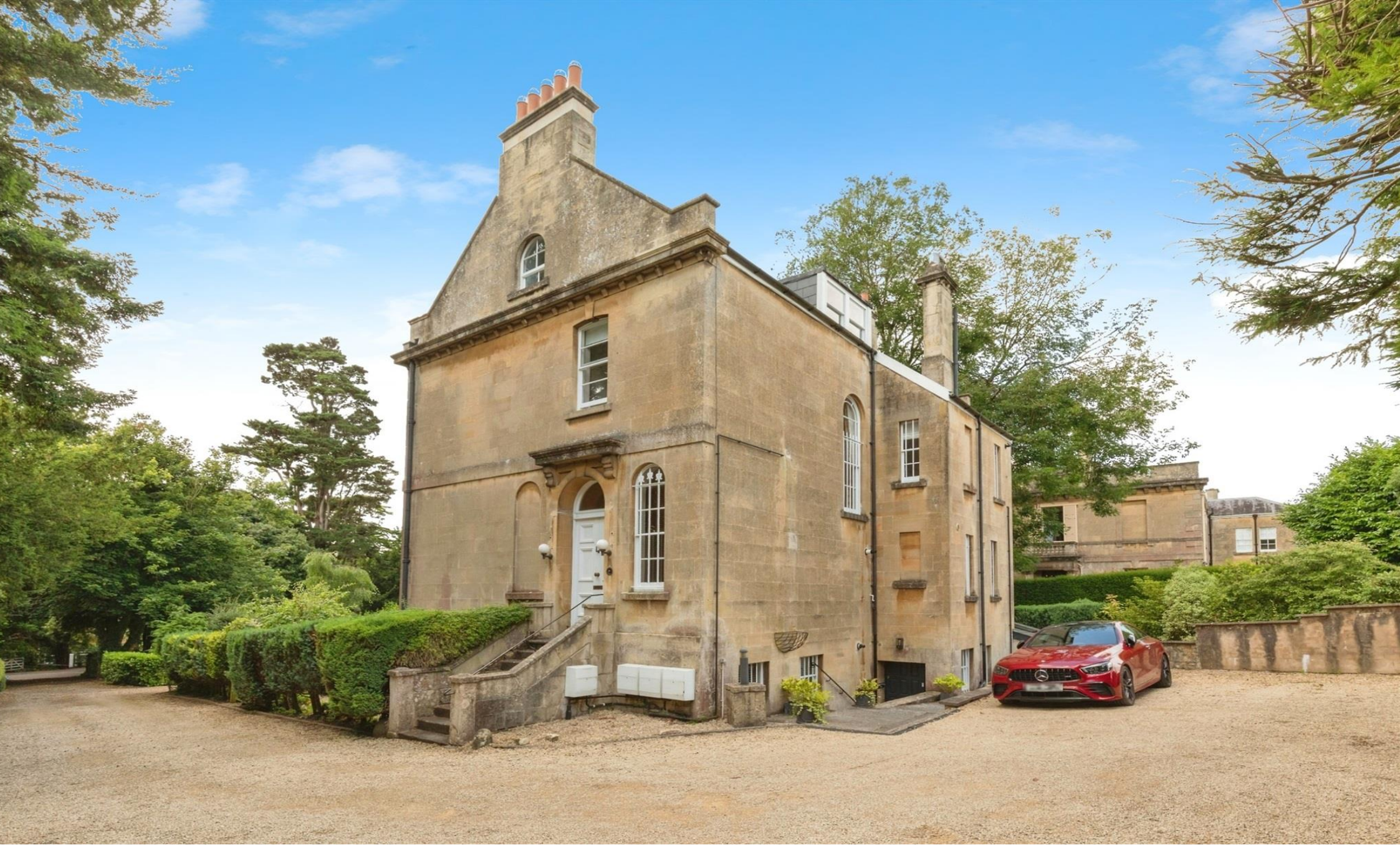
Summerfield House Weston Park, Bath BA1 4AS