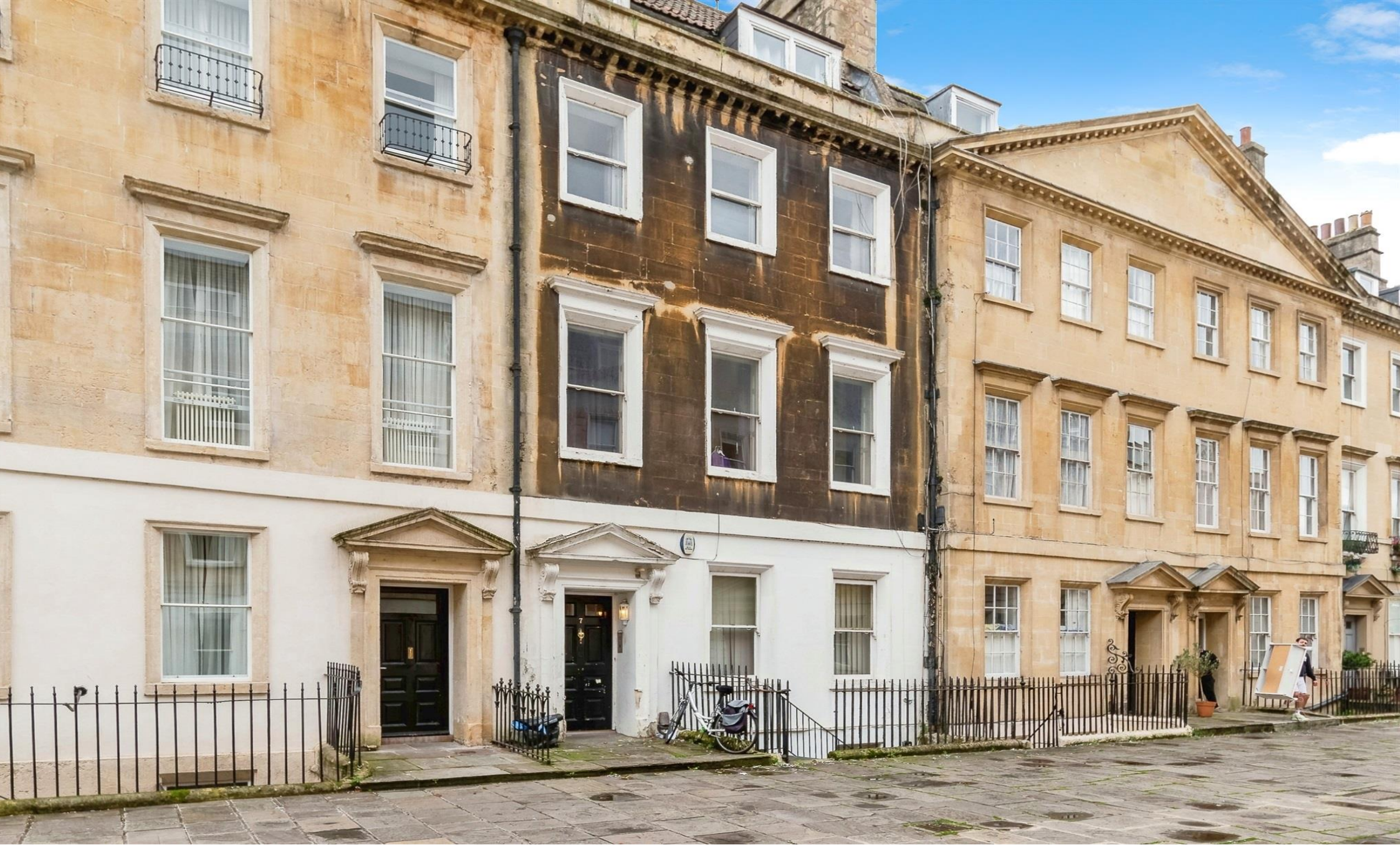
Top Floor Flat Duke Street, Bath BA2 4AG