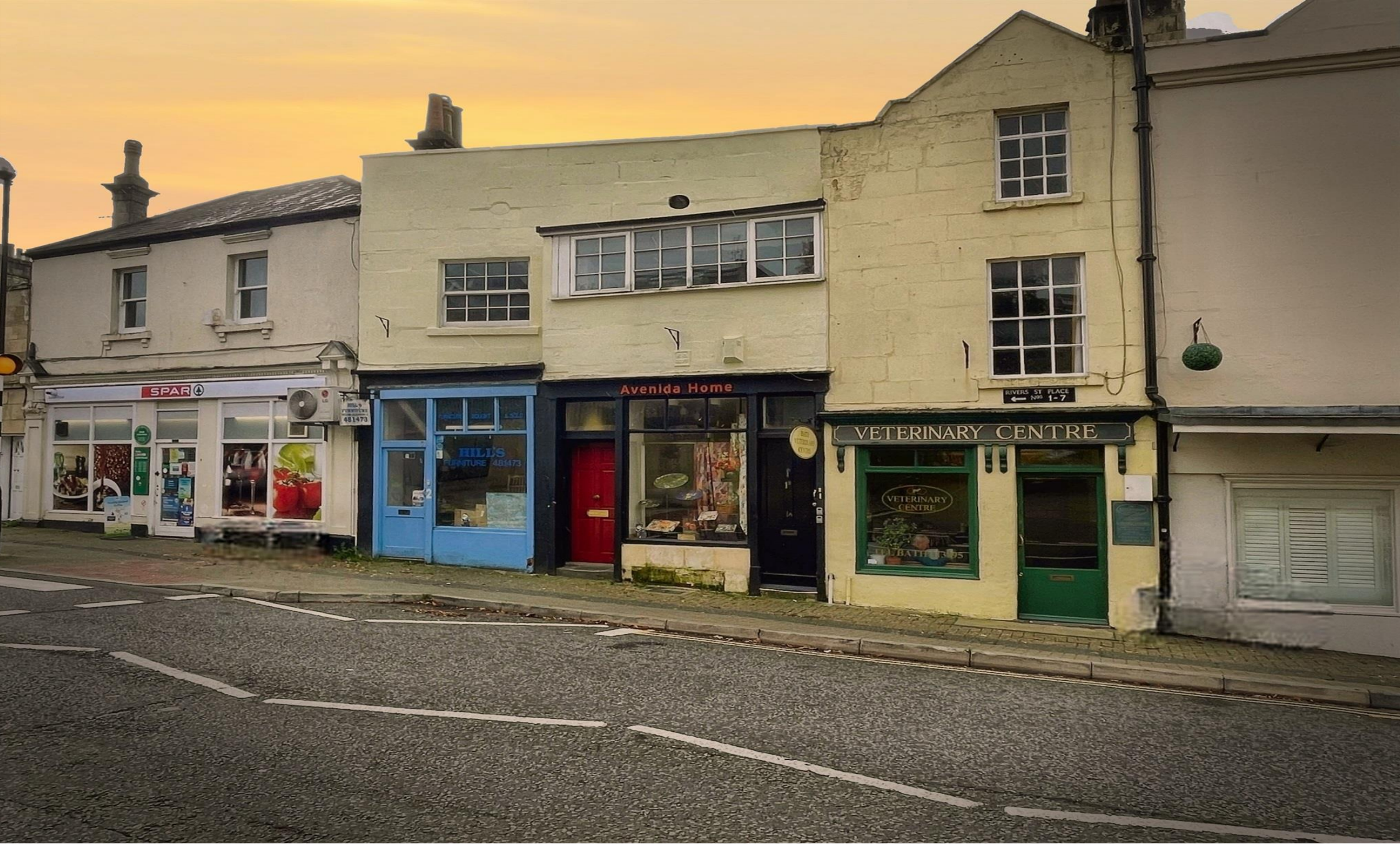
B Rivers Street Place, Bath BA1 2RS