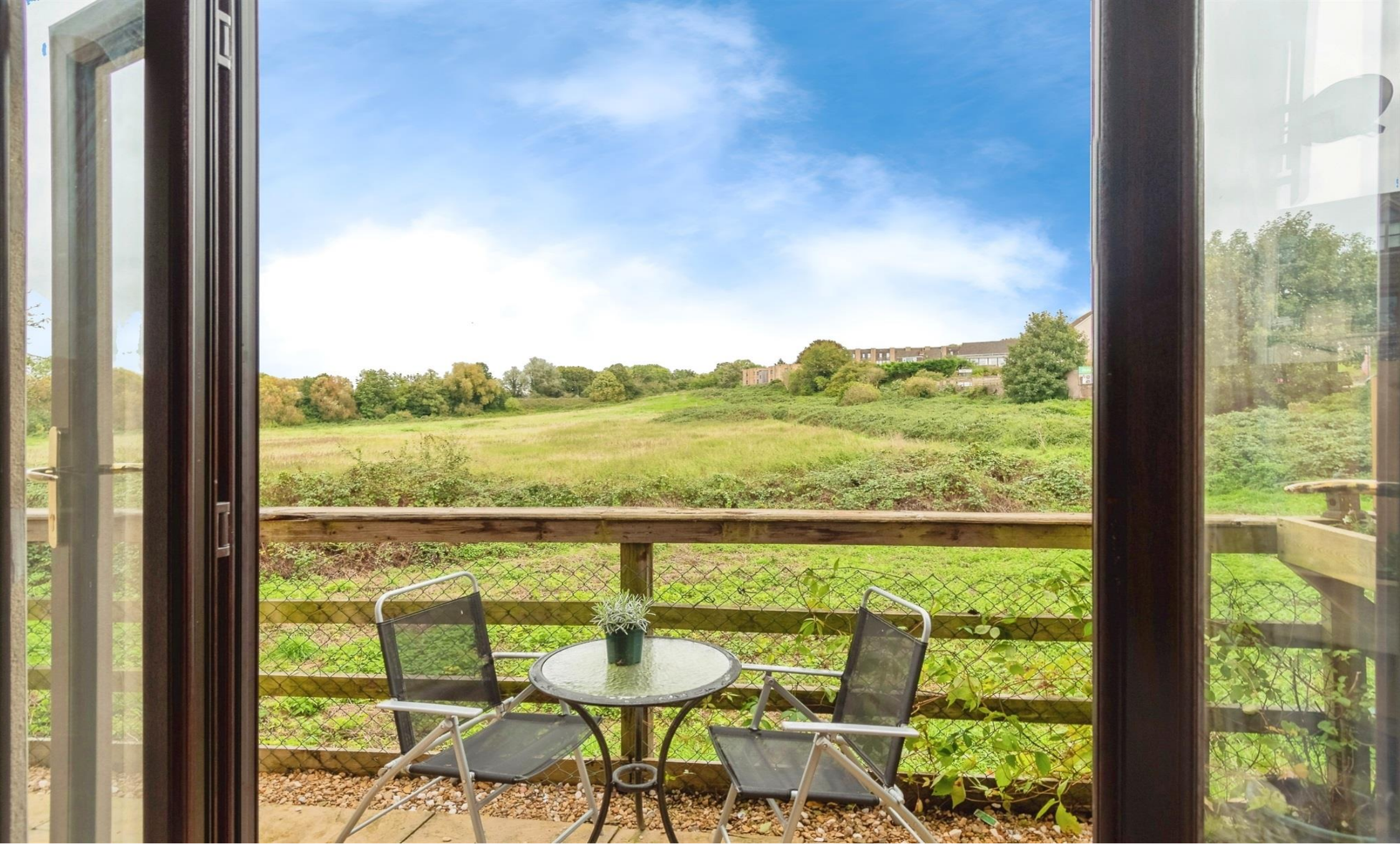
Trescothick Close, Keynsham Bristol BS31 2BD