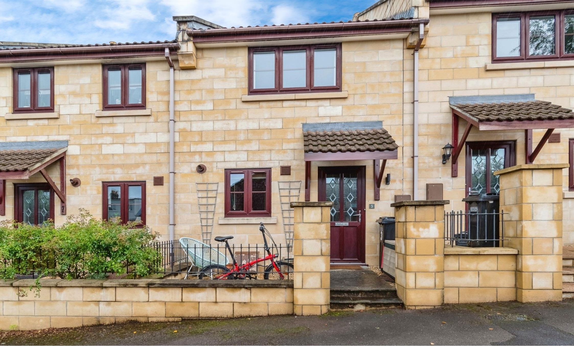
Mayfield Mews, Bath BA2 3FD