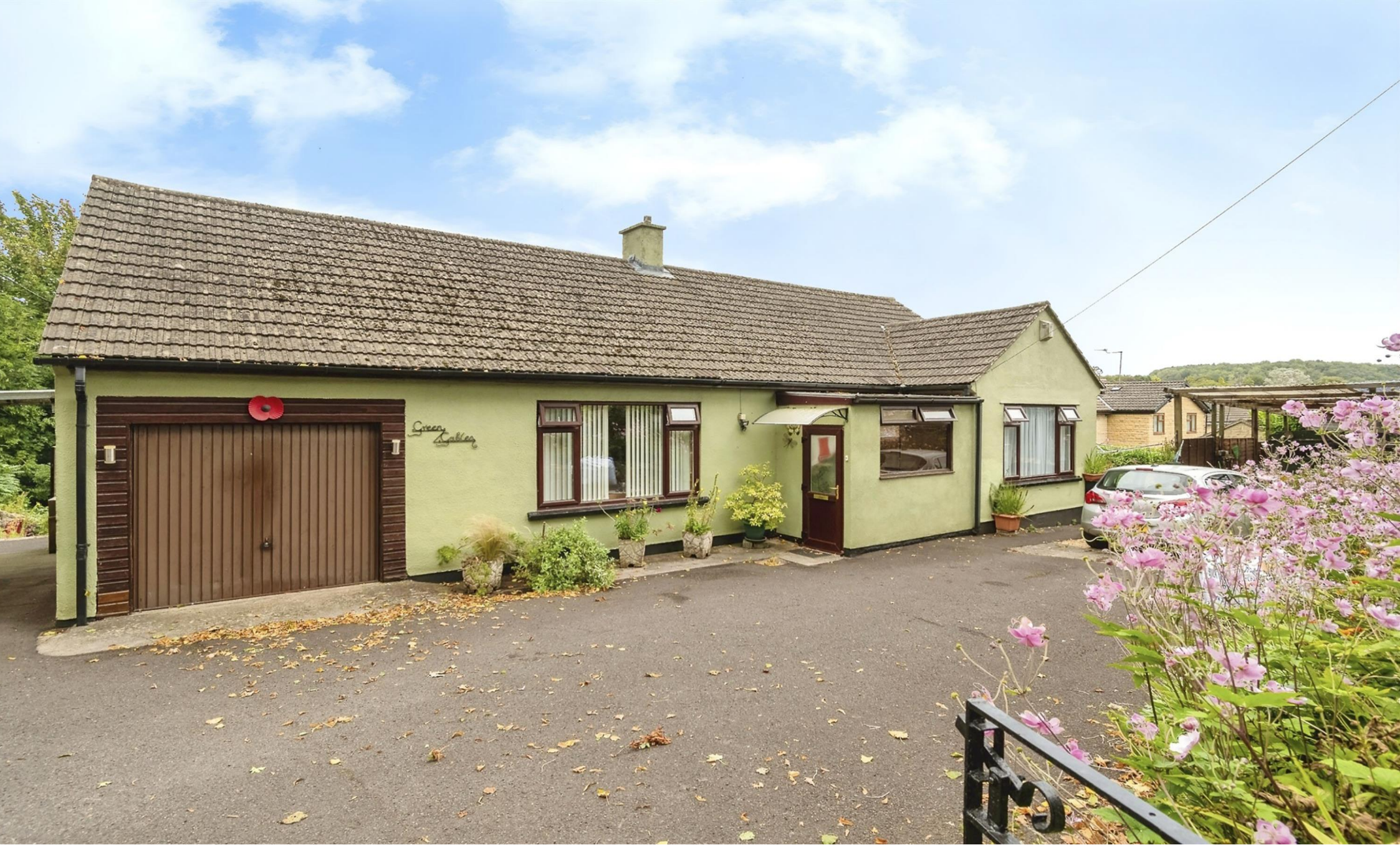
Green Gables Wells Road, Westfield Radstock BA3 3RL