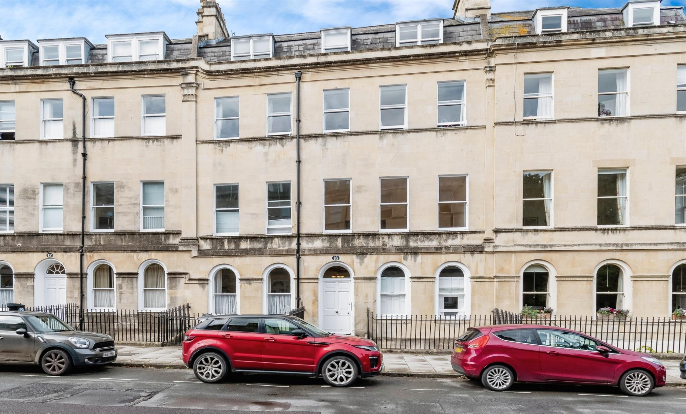
Henrietta Street, BATH, BA2 6LW