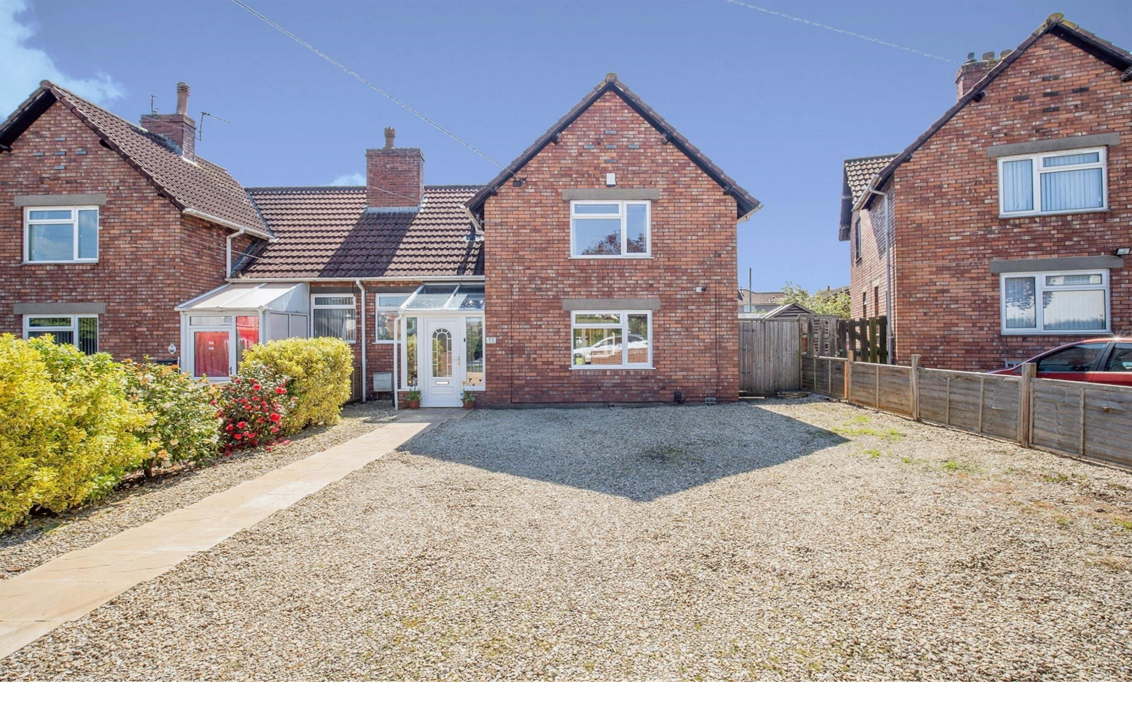
St. Francis Road, Keynsham, Bristol BS31 2DT