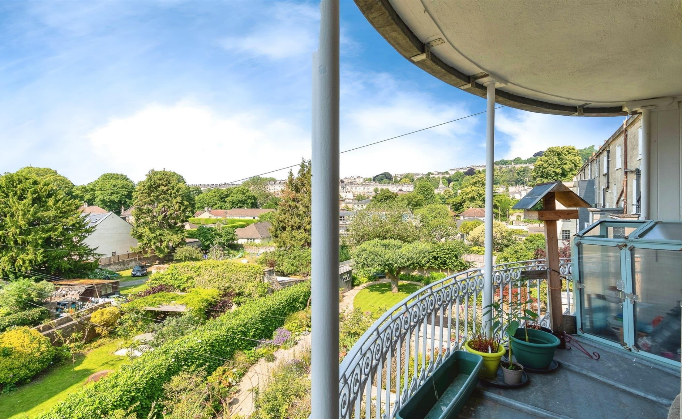
Second Floor Flat, Bathwick Street, Bath, BA2 6PA