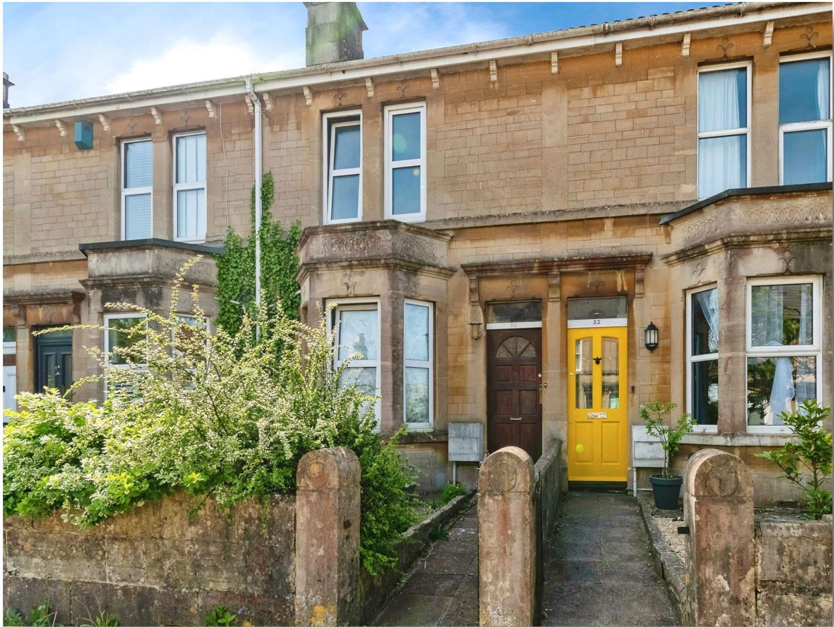
Hawthorn Grove, Bath, BA2 5QA