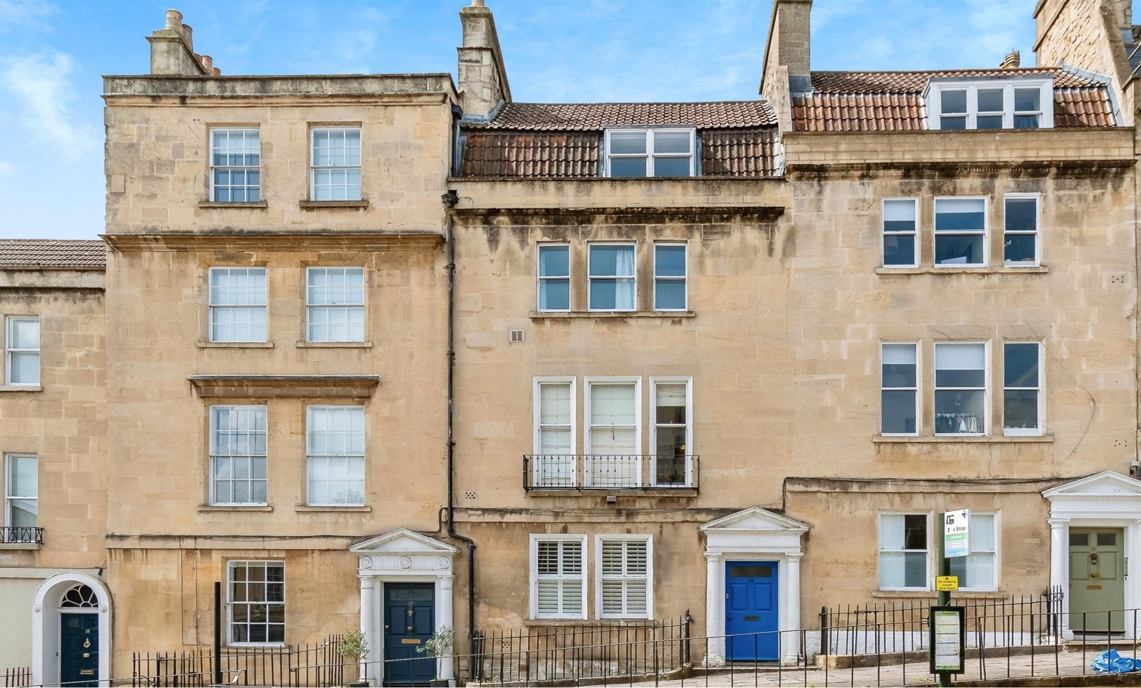
Belvedere, Bath, BA1 5ED