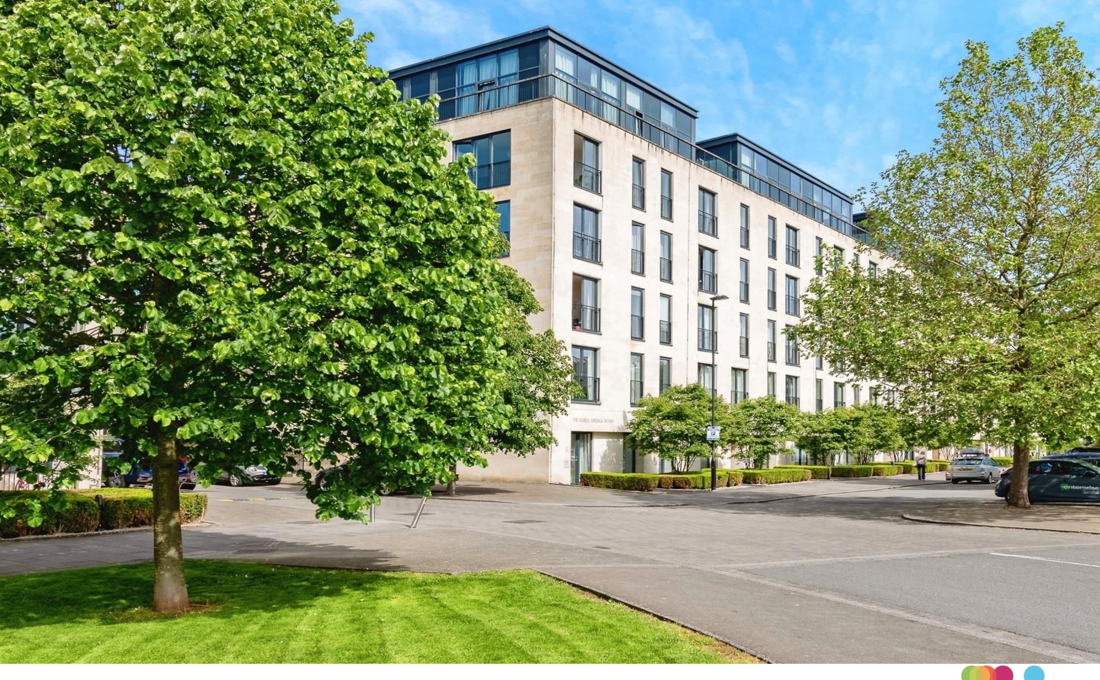
Palladian, Victoria Bridge Road, Bath BA2 3FJ