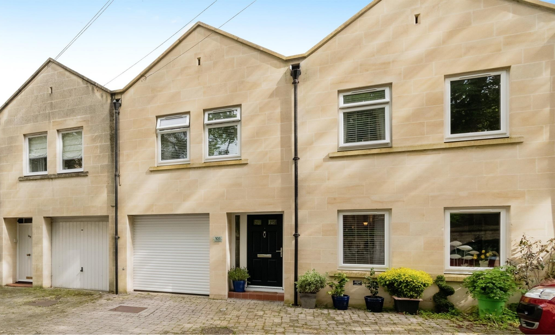
Sydney Mews, Bath, BA2 4ED