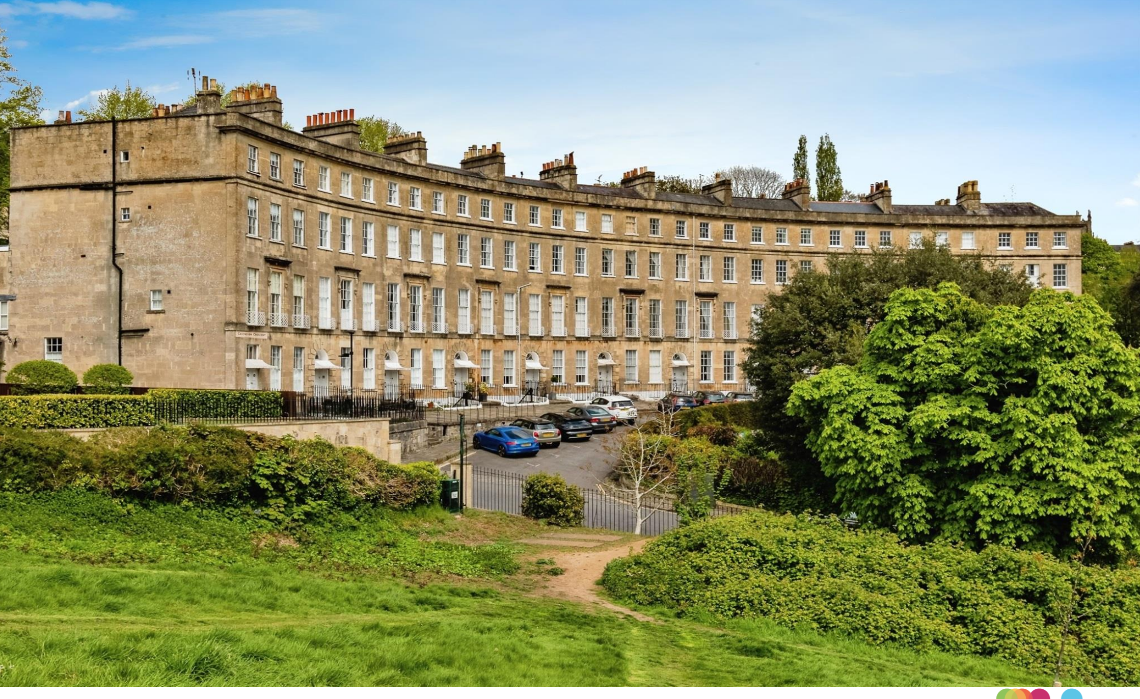
Cavendish Crescent, Bath, BA1 2UG