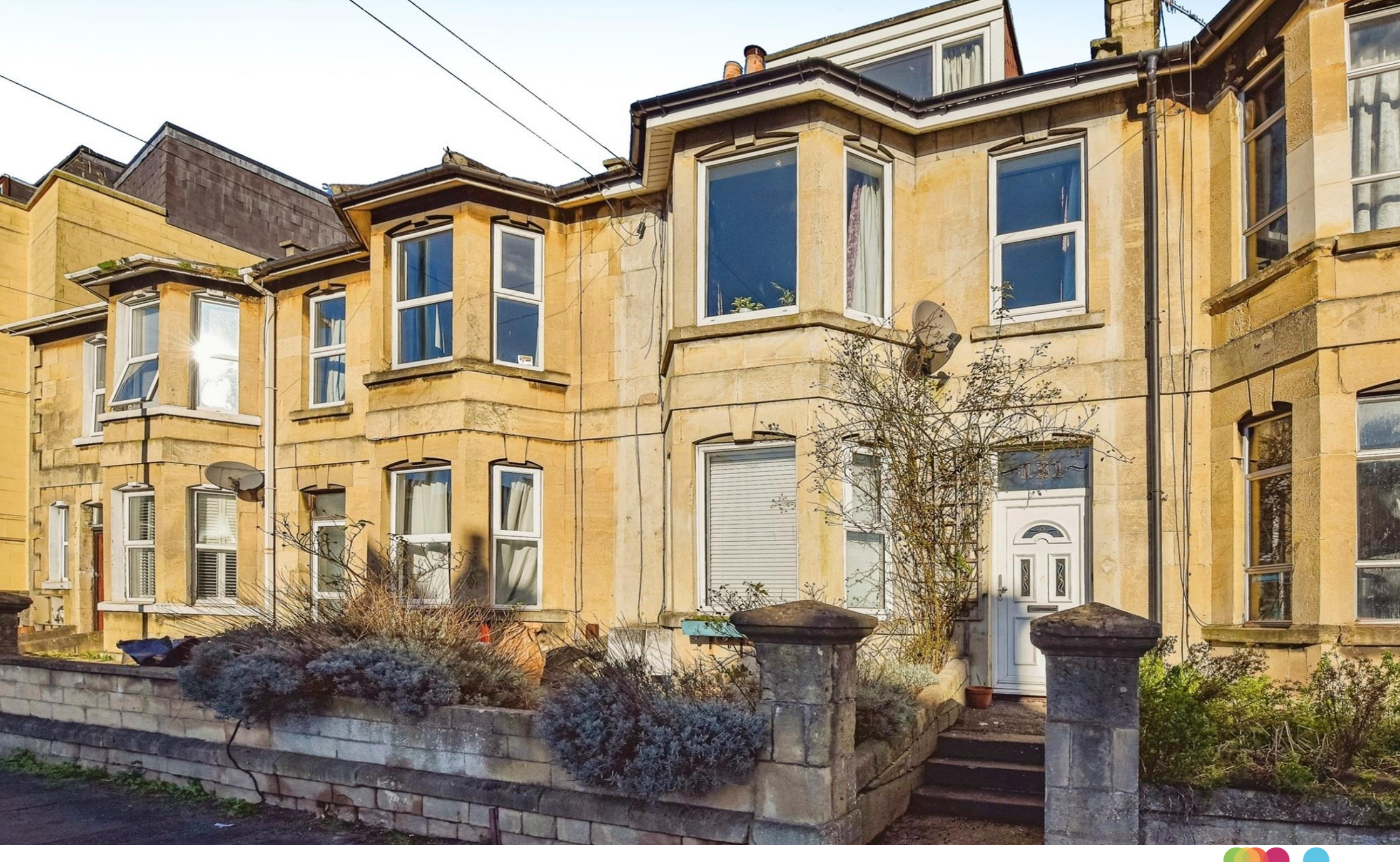
Lower Bristol Road, Bath, BA2 3DL