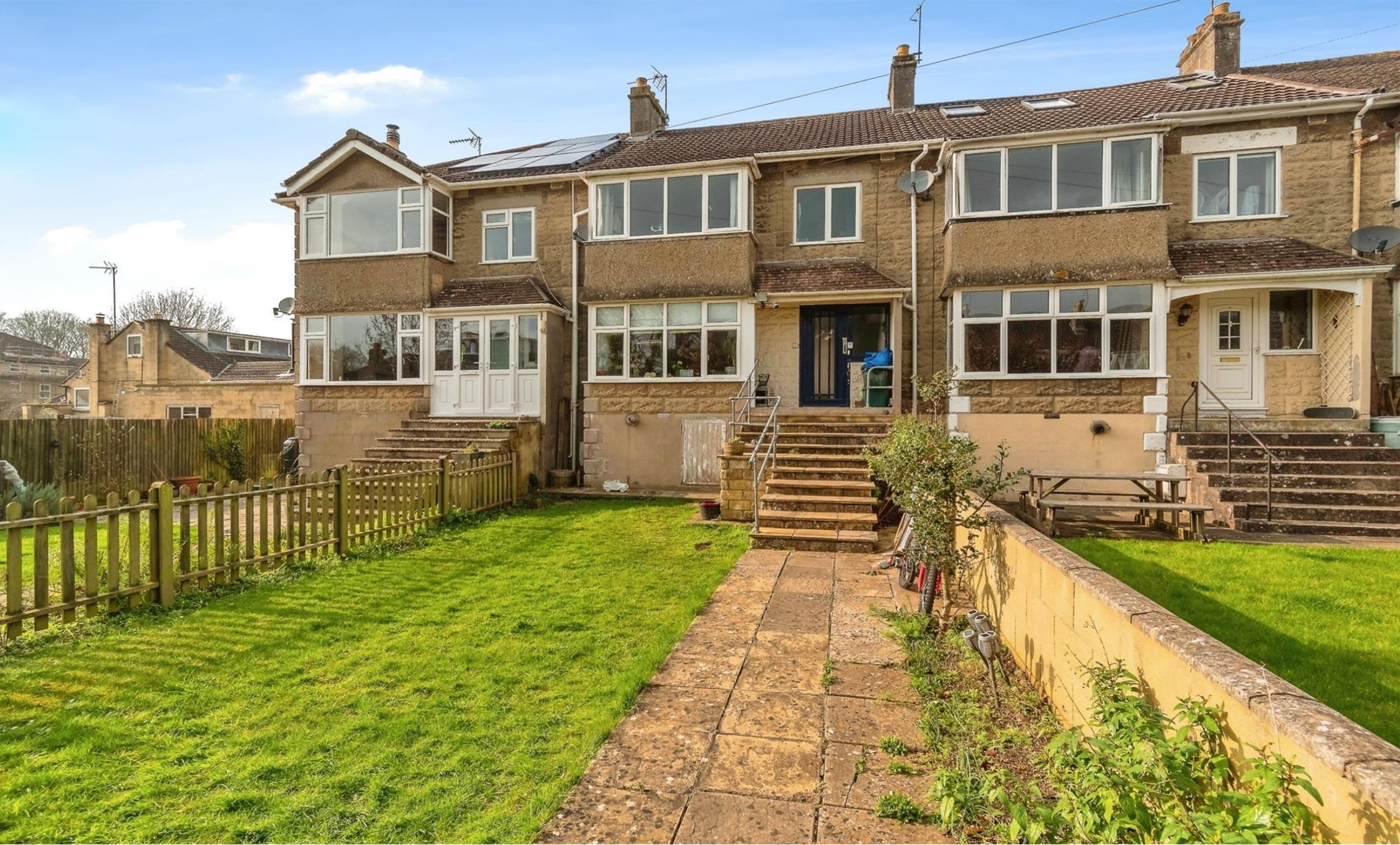
Westfield Park, Bath, BA1 3HS