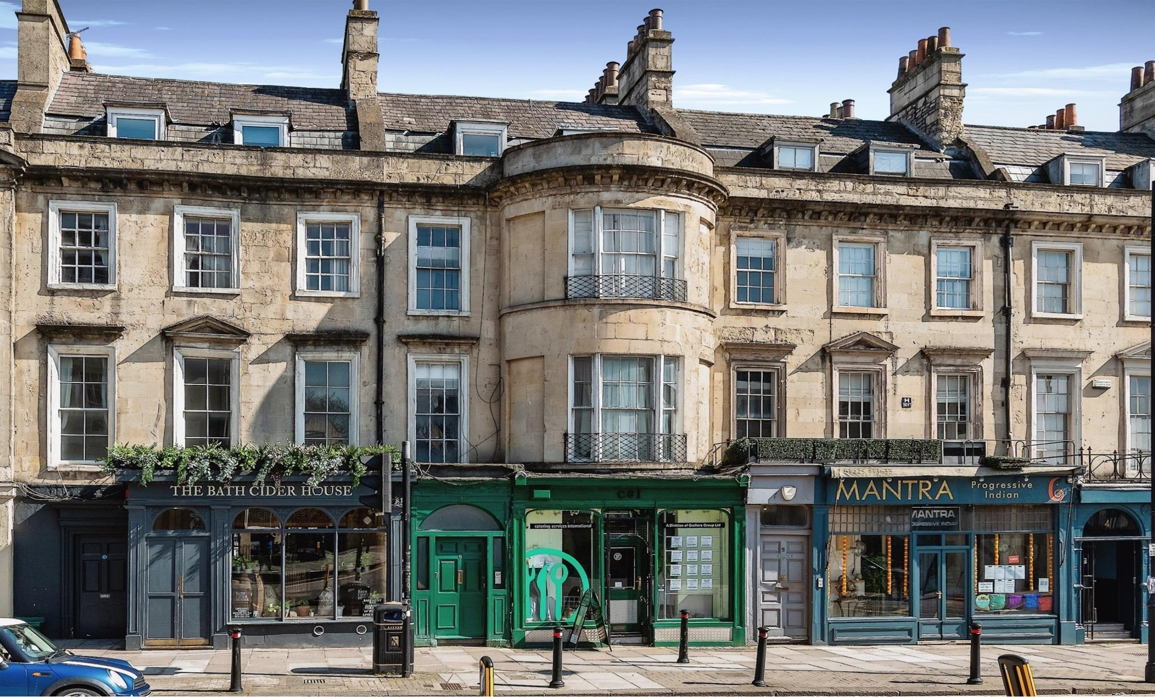
Bladud Buildings, Bath, BA1 5LS